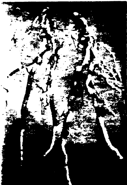
Fig. 2. Typical symptoms of corky root of tomato caused by Pyrenochaeta lycopersici . Note the banded root lesions with a corky appearance.

Systems-level research will be important to understanding the ramifications of the whole complex of cultural practices, not only for virus diseases but also for other foliar and root diseases. Farming systems research with farmer participation is essential to devise appropriate management strategies for alternative agricultural systems. Changes in agricultural practices will not be implemented if each of us is recommending an individual solution to an isolated problem. Truly interdisciplinary research will be needed rather than disciplinary or even multidisciplinary research (46).