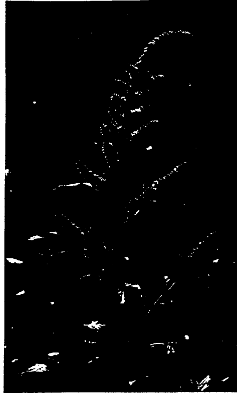
Higher populations of pigweed, a preferred host of the armyworm, seemed to aggravate pest problems for the organic tomatoes.

tor setup used varied according to the crop. In processing tomatoes, cultivation was done using a pair of disks, each set within 2 inches of the tomato seedline followed by L-shaped weed knives to clean the sides of the beds. Safflower and beans were cultivated using a rolling cultivator (Lilliston),