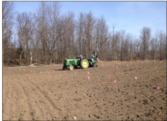
Image 1. Seeding spring wheat variety trial, Alburgh, VT, 2014.

The project evaluated 19 spring wheat varieties (Table 1). The data reported was collected from the experimental site located at Borderview Research Farm in Alburgh, VT. The soil type was a Benson silt loam soil. The plots were seeded on 25-Apr and harvested on 8-Aug (Image 1).