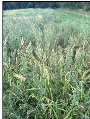
Image 4. Flax control plot.

The harvest data supports this; the wide row treatment yielded the most at 622 lbs. acre -1 (Figure 1). Interestingly, in 2014 lower overall weed pressure resulted in successful harvest from all treatment plots (Table 1). Flax yields averaged 1,158 lbs. acre -1 , which is closer to yields from traditional flax growing regions. There was no significant difference in yields or test weight amongst any of the weed control techniques. The reasons for this