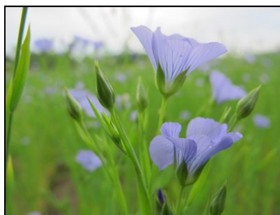
Image 1. Flowering flax, Alburgh, VT.