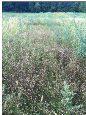
Image 3. Narrow row flax.