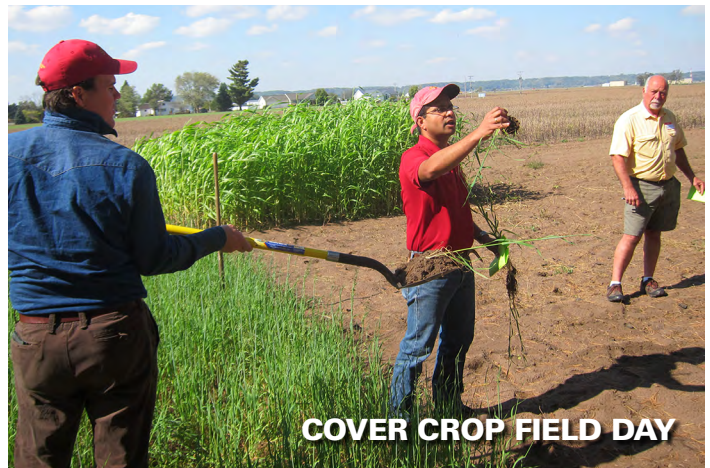
COVER CROP FIELD DAY

Crop rotation is a planned system of growing different crops in succession on the same land. Benefits of crop rotation in terms of weed, pest, and disease management are well documented. Cover crops can be used in crop rotation plans to break pest cycles, add organic matter, and improve soil quality and health. Vegetables have many potential seasons of production, and given the choices available with long- and short-term cover crop life cycles, cover crops can easily fit into any crop rotation plan. Periods of 1–2 months between harvest of early planted spring crops and planting of fall crops can be filled using fast-growing, warm-season cover crops, such as buckwheat, cowpea, oats, and sorghum-sudangrass. Table 3 (page 6) provides a few examples and scenarios of how cover crops could be integrated with vegetable cropping systems.