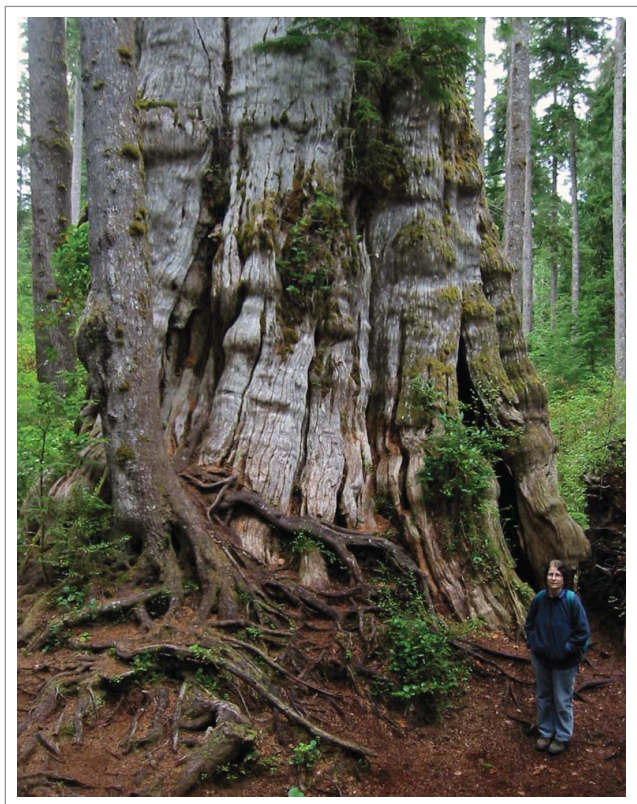
Figure 1. The so-called “Quinault-Lake Cedar.” This is the largest known WRC in the world, with a 19.5 ft (5.94 m) diameter at breast height and an estimated wood volume of 17650 ft 3 (500 m 3 ). 9 It is located ~50 mi (80 km) from Tree Fever.

Among individual protective devices, rigid mesh (“Vexar”) tubes are most common. The tubes are installed around