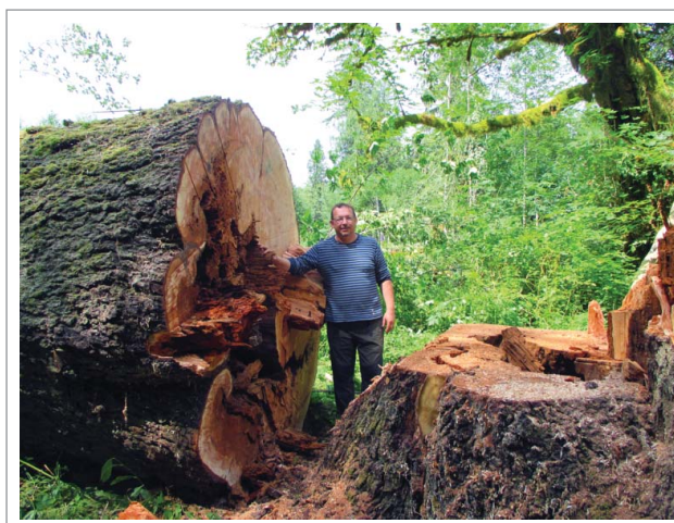
Figure 5. This rotten Sitka spruce was removed from Tree Fever during the 2014 rehab harvest. The tree had an 8.9 ft (2.7 m) diameter at breast height.

In July of 2014, the old Sitka trees were removed from this strip of land (Fig. 5), and the thickets of vine maple and devil's clubs (Fig. 6A) were cleared. Then in March of 2015, the experimental planta-tion was established (Fig. 6B). 1800 WRC seedlings were planted without any protection, each marked with a red flag. Another 1500 WRC seedlings were