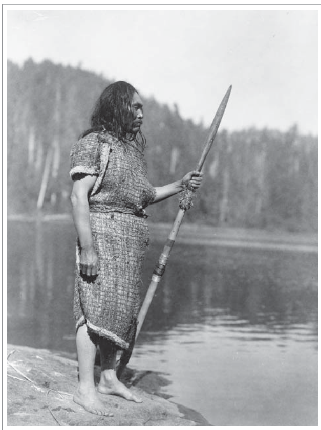
Figure 2. Nuu-chah-nulth (Nootka) tribesman, likely a whaler, wearing traditional cedar-bark clothes, Washington State, c. 1910.

seedlings at the time of planting. Most owners have a tube installed by weaving a small bamboo stick through the tube's wall and pressing it into the ground. There seems to be consensus, however, that this method provides little protection from elk. Using a larger stick and fixing a tube to the stick with two cable ties (Fig. 3) is recommended if elk migrate through your area.