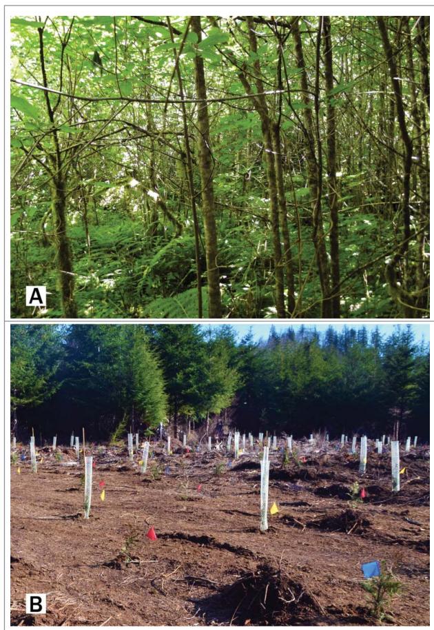
Figure 6. Before and after. Low-grade hardwoods in the narrow strip of land between the West Sat-sop RMZ and main Douglas fir stands before the rehab harvest (July 2014) (A). The thickest trunks in the front have a diameter of ~1.5 in (4 cm). After the harvest, site preparation, and planting, this strip of land became a WRC research plantation (March 2015) (B).

protected with Vexar tubes and marked with yellow flags (Fig. 3). And yet another 1800 WRC seedlings were co-planted with Sitka spruce seedlings and marked with blue flags (Fig. 4A). Similar to the WRC, Sitka is a shade-tolerant tree and it should do well on this plantation. These three modes of protection were intermixed (Figs. 3,6B). We will test quantitatively, on the same site, whether the co-planting method works, and whether it works better or worse than Vexar tubes under our conditions. Without quantitative data from studies like this one, it is just too risky for tree farmers to start WRC plantations that take a half a century to grow!