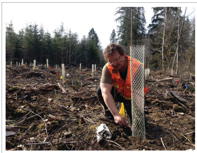
Figure 3. The author installing a Vexar tube around a WRC seedling with two cable ties fixed to a bamboo stick. Tree Fever research plantation, March 2015.

“ankylin”). In fact, many plants naturally contain potent TRP agonists, 12 which are a part of plants’ intrinsic defenses against herbivores. It is tempting to speculate that the ability of plants to produce TRP agonists can be harnessed to develop genetically modified browsing-resistant plants. Such browsing-resistant varieties of WRC are apparently under development, but no genetically-resistant seedlings are available yet, at least not to small farmers.