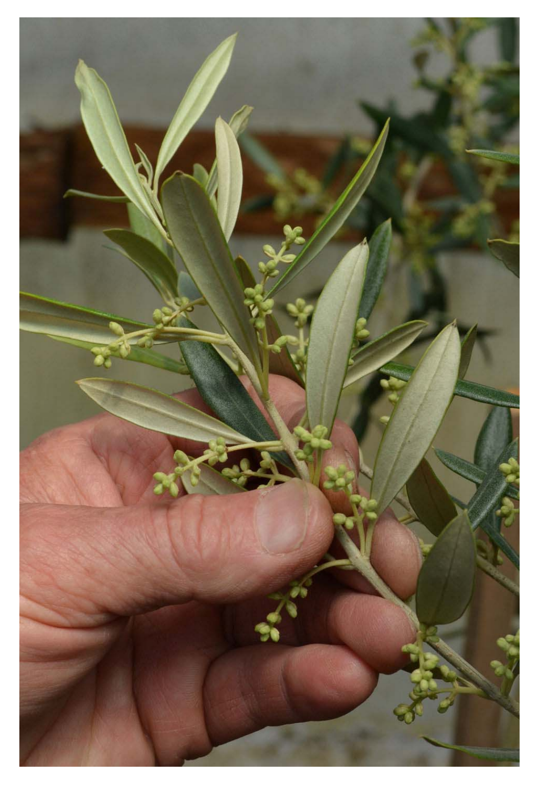
Some promising olive trees