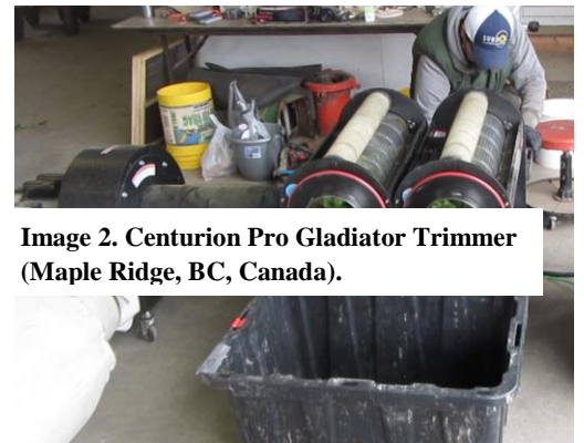
Image 2. Centurion Pro Gladiator Trimmer (Maple Ridge, BC, Canada).

Autoflower varieties are included for comparison with full season plants in the variety trial. Each was evaluated using similar metrics and received similar field preparation to those grown within the variety trial. Spacing for autoflower varieties was reduced to 2’ and were similarly planted into irrigated black plastic. Autoflower varieties ‘Auto Ceiba,’ ‘Early Bird 1,’ and ‘Early Bird 2’ are included for comparison, but were not included for statistical comparison due to unique growth habit.