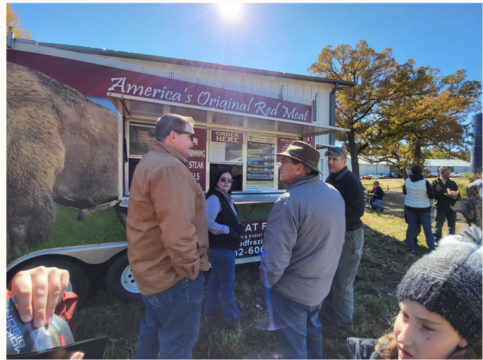
Illinois Field Day