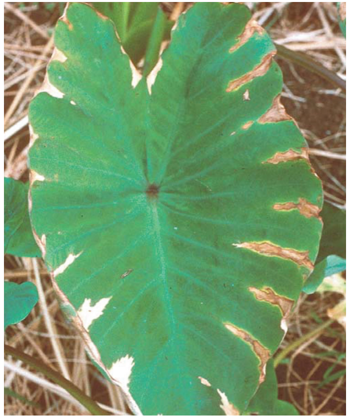
Potassium deficiency in 'Bun Long' taro leaf.