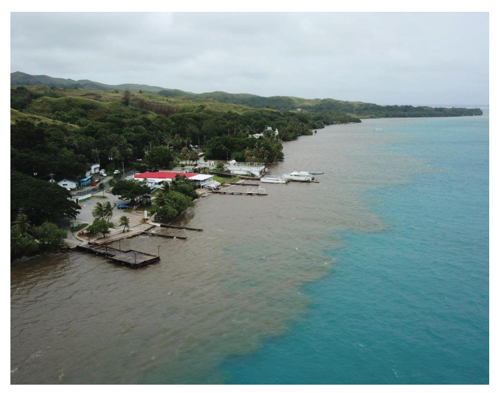
Figure 5 Runoff along the coastline of Merizo, Guam, after Tropical Storm Maria in July 2018.

Not all nutrients applied to the soil are taken up by crops, and the unused portion may become an environmental problem. The remaining nutrients may stay in the soil building up soil reserves and later become available, or they may leach through the soil or run off or volatilize into the atmosphere. Excessively high soil levels of one nutrient can affect the availability of other nutrients. In tropical conditions, all soluble nitrogen compounds are fairly quickly converted to nitrates, which move freely with soil water. Nitrogen is the most likely nutrient to become an environmental problem. Phosphorus applied to soils that is not used by plants is tied up by clay particles in the soil. The unused phosphorus remains in the soil unless it is washed off the land or carried off by soil erosion. In surface waters high phosphorus levels result in algal blooms.