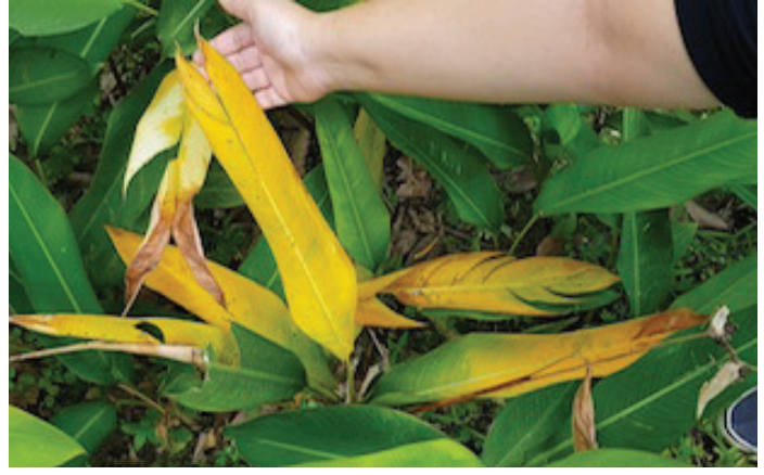
Figure 2 Yellow discoloration in leaves from nitrogen deficiency.

Phosphorus (P) is taken up by plants in smaller quantities than either nitrogen or potassium. In most soils a large portion of the phosphorus is tied up chemically and thus is not available to plants. Since P is bound by soil particles, it is not subject to leaching or runoff. Phosphorus does, however, move along with soil particles when soils erode. Elevated levels of P in surface waters encourage the undesired growth of algae.