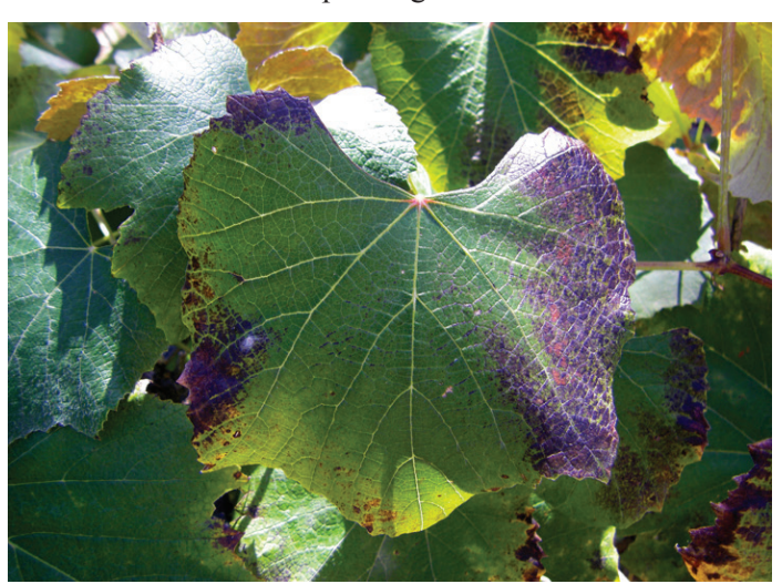
Figure 3 Purpling of the outer part of the leaf indicates phosphorus deficiency.

If the soil test shows that phosphorus needs to be applied, an amount must be applied that exceeds the difference between the available P in the soil and the desired level. All the phosphorus required to produce a vegetable crop is applied prior to planting. In soils that fix large amounts of phosphorus, the P fertilizer should be applied in a band and covered with soil before planting.