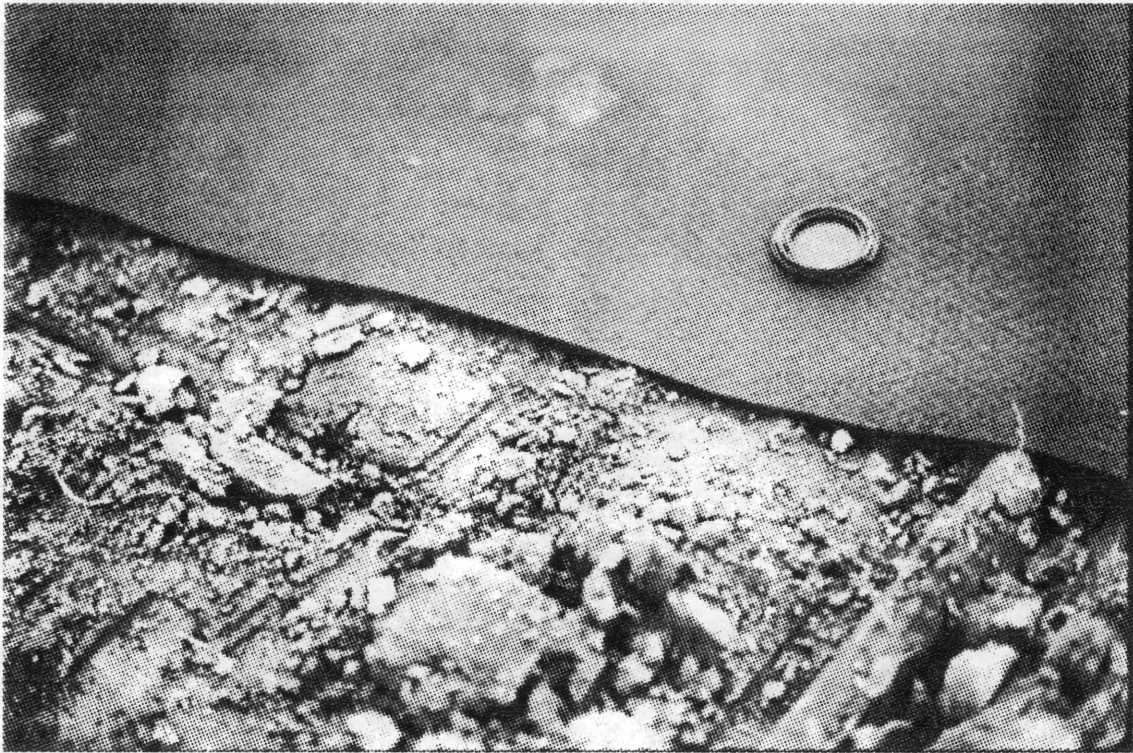
Figure 2. Close-up of installation of geotextile fabric on loafing area.