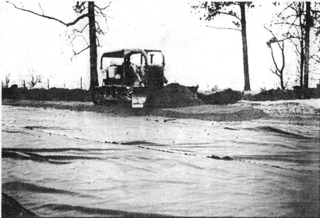
Figure 3. Installation of gravel over loafing area.