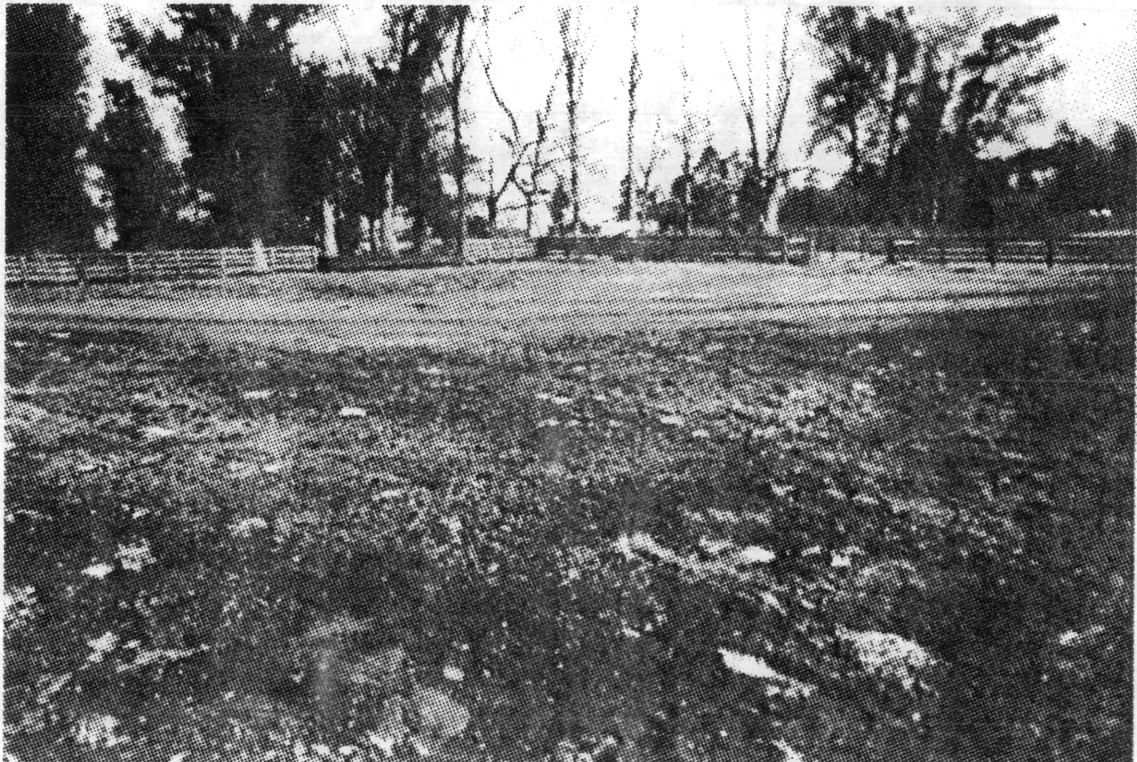
Figure 5. Accumulation of manure on gravelled loafing area.