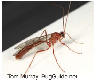
Tom Murray, BugGuide.net

Some adults are predaceous, but most feed on pollen and nectar. Eggs are laid and larvae develop in or on host