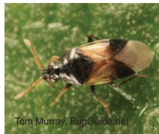
Tom Murray, BugGuide.net

Both immature adults and larvae feed on a variety of small prey including thrips, spider mites, insect eggs, aphids, and small caterpillars