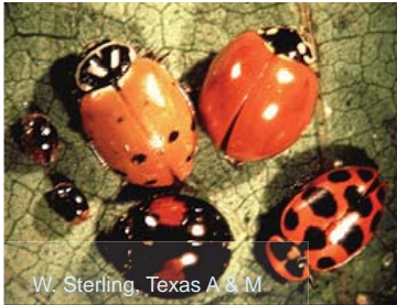
W. Sterling, Texas A & M

Commonly predaceous as adults and larva. The adults also feed on pollen, nectar, and aphid honeydew