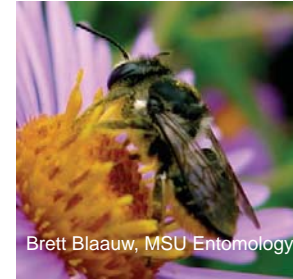
Brett Blaauw, MSU Entomology

Names reflect the materials nest cells are made from - soil or leaves. Efficient pollinators that carry pollen on ventral side of abdomen.