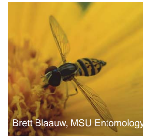
Brett Blaauw, MSU Entomology

Look like bees, but only have 2 wings. Adults feed on pollen and nectar, larvae are predaceous