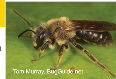
Tom Murray, BugGuide.net

Small to moderate-sized, solitary, and nest in the ground.