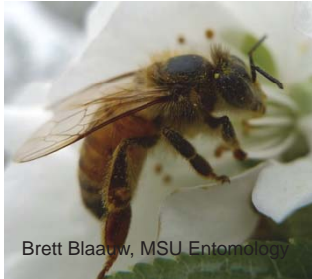
Brett Blaauw, MSU Entomology

The most commonly domesticated bee. Often used in fruit production for their pollination services.