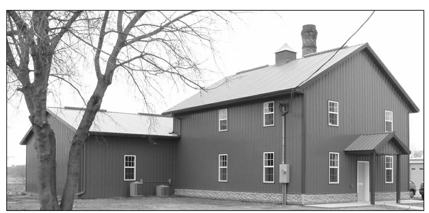
The chimney of the historic mill stands to the west of the new building. It can be seen poking above the roof just behind the cupola.

Gary, however, is responsible for locating the stamped tin ceiling that recalls the old stamped tin walls. He found it in Florida, via the internet.