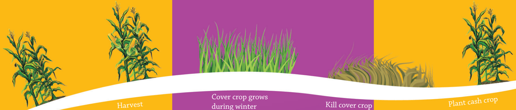
Plant cover crop before harvest