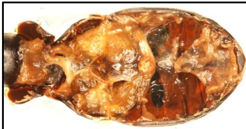
Figure 1. Tissues used in carabid sub-samples for stable carbon isotope processing.

RECENT Sub-Sample: Flight muscles, organs, and other soft tissues