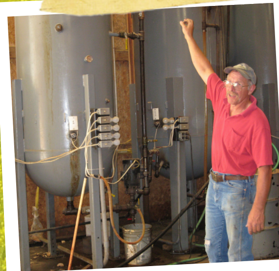
Boreen Ranch Biodiesel Processor