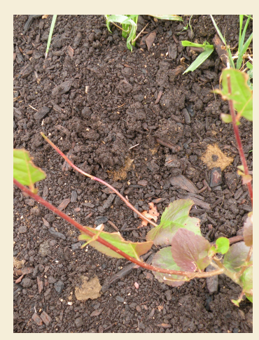
8 month old micropropagated Aronia berry planted in May 2010 at Hilltop Community Farm.

help reduce the risk for cancer, heart disease, inflammation, diabetes, bacterial infections and neurological diseases in humans. They also slow the aging process. Source - Eldon Everhart, Horticulture - Iowa State Extension