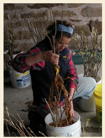
'Holy black currant root wad'. First year shrub roots emerging from a 2 hr. soak in compost tea before being planted at Hilltop Community Farm.

Scottish lore held that good fortune would surely follow if, after the wedding ceremony, in an apparently ancient show of 'tough love,' the mother of the bride met her at the door and broke a currant bun over her head.