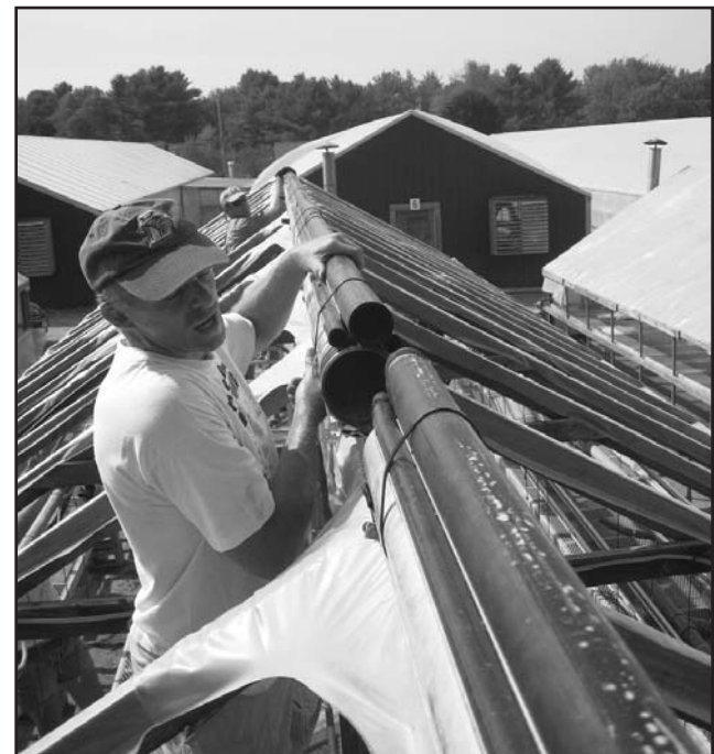
Figure 4. Installation of bubble system by consulting engineer and UVM personnel.

SunArc, a company located in Canada, expanded and improved upon the concept ( www.sunarc.ca/english/home.html ), and until recently marketed the technology in the US and Canada. Economic constraints linked with the recent financial crisis led to downsizing Sunarc, though rights to the system have been shared with a company in Israel, where it is being developed as a means of shading. While this technology is not currently available commercially, given the steadily increasing cost of fuel, we believe the work we are doing to test the system in hoop houses will revive interest and lead to its expanded commercial use by growers.