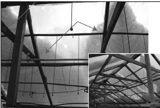
Figure 2. Bubble system in operation, filling void with soap bubbles. Arrows indicate stream of bubbles generated at the peak of the greenhouse.

Greenhouses are commonly covered with two layers of plastic that are inflated with air, which provides a small level of insulation. The bubble insulation system is reported to increase the R-value for the standard inflated greenhouse from 1-2 to over 30.