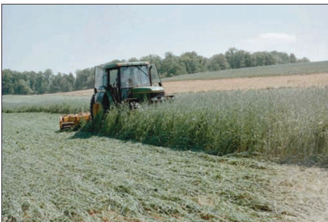
Cereal ryegrass rolled before planting soybeans. Some farmers drill soybeans directly into the cereal rye then spray the cereal rye after the soybeans emerge. The cereal rye helps to control weeds and hold soil moisture going into the summer.

recycled for the following corn crop but depending upon the C:N ratio, may tie up nitrogen short-term, hurting corn yields.