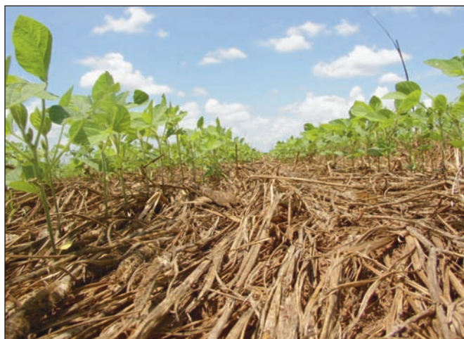
No-till soybeans drilled into a cover crop. Cereal rye and annual ryegrass used as a grass cover crops before soybeans, a legume grain crop.

Living cover crops can significantly alter soil temperatures. Cover crops decreased the amplitude of day and night temperatures more than average temperatures resulting in less variability. Cover crop mulches protect the soil from cold nights and slow down cooling. This may be a benefit in hot regions, but may slow growth in cooler regions. Winter cover crops moderate temperatures in the winter. Standing crops have higher soil temperatures than flat crops. Row cleaners help manage residues and improve soil temperatures in no-till fields. Corn responds to warmer soil temperatures so strip tilling in a 10 inch band by moving the top soil residue may increase stand establishment and corn growth initially when converting from conventional tillage to no-till.