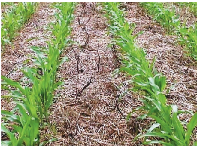
No-till corn planted into cowpeas as a cover crop with no additional commercial N fertilizer.

In natural systems, the land is not extensively tilled and a continuous living cover protects the soil from rain drop impact (less erosion). By growing a cover crop in the winter, carbon inputs are added to the soil, keeping nutrients recycling within the system. Nitrogen is directly linked to carbon so less carbon losses means more nitrogen stays in the soil rather than being lost through leaching or runoff. Soil nutrients (N and P) are recycled within the natural system. Plant roots and soil residues protect the soil and keep the soil from eroding and reduce P losses resulting in less hypoxia and eutrophication. Microbial diversity and