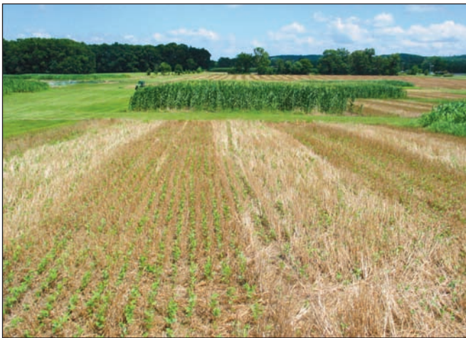
Cowpeas may supply 120–150 pounds of N to no-till corn. No-till corn (background) planted into cowpeas with no additional commercial fertilizer. Note dark green color indicating good N fertilization. Cowpeas (foreground) drilled into wheat stubble 7 days after planting.

For cereal rye and annual ryegrass before corn, plan to kill it 3–4 weeks before planting (when it is young and lush and the C:N ratio is lower). If it cannot be killed until about 2 weeks before planting, apply nitrogen (as liquid fertilizer or dry fertilizer). Cereal rye and annual ryegrass provide good rooting and soil structure and absorb nitrogen, which can be