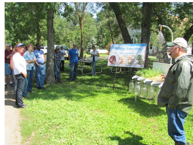
Rainfall Simulator Demonstration— Time to be determined