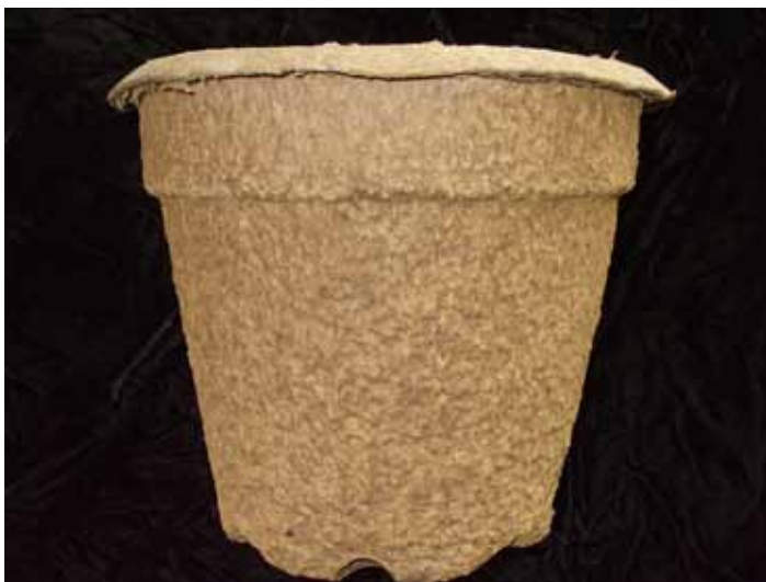
Figure 2. Some alternative containers are made from wood fiber, recycled paper, or cardboard.