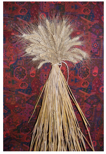
Vermont Winter Soft Wheat - Seed from 1898