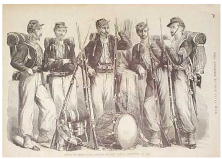
Engraving of Civil War Soldiers

In the early morning damp and cool we marched down off the heights of Brattleboro to take train for this place. Once in the car the, dashing young cavalry officer, who had us in charge, gave notice he had placed men through the cars, with loaded revolvers with orders to shoot any person attempting to escape, or jump from the window, and that any one would be shot if he even put his head out of the window. 28th, 8th month, I863