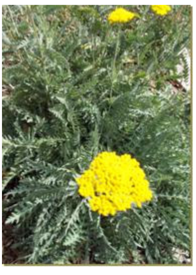
Above (left): Manzanilla (chamomile) flowers, consumed as a tea, assists with sleep disorders. Plumajillo (yarrow), has traditionally been used for wounds as it helps to stop bleeding, along with many other uses.

Another common remedio that is usually grown in gardens is manzanilla or chamomile. When someone usually can't sleep, they are prescribed a cup of tea before bedtime. It is good for treating stomachaches and to treat head colds, flu symptoms, and helps reduce fevers. It can also relieve aching joints and many people use it to wash their hair.