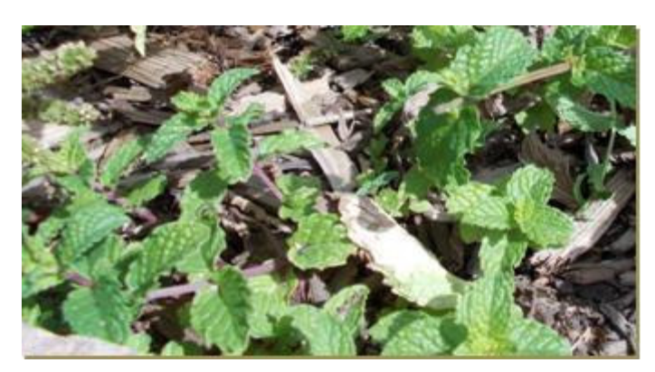
Yerba buena (spearmint) tea has long been used for nausea and indigestion, heartburn, stomachache, and gas.