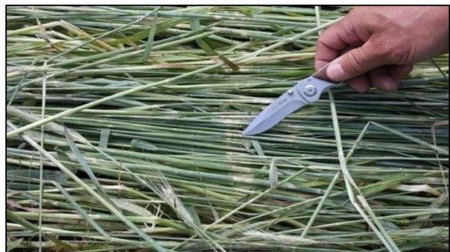
Figure 2. Rye cover crop that has been rolled and crimped.

In 2012, the University of Vermont Extension conducted the fourth year of an experiment to evaluate the impact of cover crop termination and reduced tillage strategies on soil health, soil nitrogen dynamics, and corn silage yield and quality. The goal is to document the positive and negative aspects of each strategy so farmers