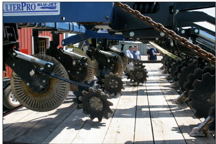
Figure 3. Blujet Coulter Pro used for strip-tillage.

Corn was planted on June 10, 2012 (var. Mycogen 2T108) at a rate of 36,000 seeds acre -1 . The no-till treatment was planted with a John Deere 1750 4-row planter, the zone-till treatment was planted with a White 6100 zone-till planter, and in the strip-till treatment was strip tilled with a Blujet Coulter Pro and planted with the no-till planter. Starter fertilizer was applied at a rate of 200 lbs. 10-20-20 to the acre in the no-till and strip-till treatments. The zone till treatment had 5 gallons acre -1 of 9-18-9 applied as starter fertilizer. The strip till treatment also had 15 gallons acre -1 10-34-0 and 10 gallons acre -1 32-0-0 UAN pre-plant fertilizer injected when the plots were strip tilled.