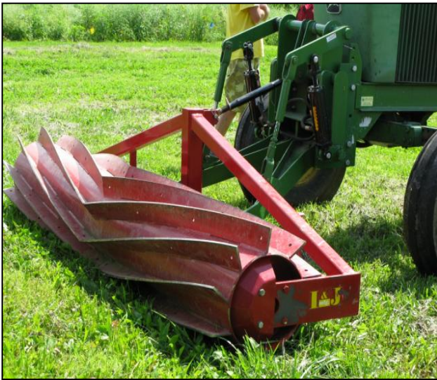
Figure 1. Roller crimper.

When a crop such as corn silage is harvested in the fall, the entire plant is removed, leaving the soil exposed through the winter. These exposed soils are more prone to run-off and erosion of sediment and nutrients into surface waters. As a means to alleviate these issues, many farmers have started to plant cover crops following harvest. Growing a cover crop can have many positive benefits to the soil and the surrounding environment. First cover crop plants produce aboveground biomass that can absorb the impact of rain drops and slow the flow of water from melting snow. The root system also aggregates soil particles to create a porous network that allows for improved water drainage. Cover crop plants can also scavenge excess soil nitrogen, keeping the nitrogen from potentially being lost through leaching, and can also reduce weed pressure in the spring. Many farmers have asked, what is the best strategy to terminate cover crops in order to reap the benefits from this practice? Cover crop management can also be paired with reduced tillage practices to further reduce potential erosion. Reduced tillage practices such as no-till, zone-till, and strip tillage cause minimal disturbance to the soil. No-till planting means that the planter seeds directly into untilled soil. No-till planters are equipped with coulters that cut into the soil, creating a slit into which a seed is dropped. Heavy press wheels are then used to