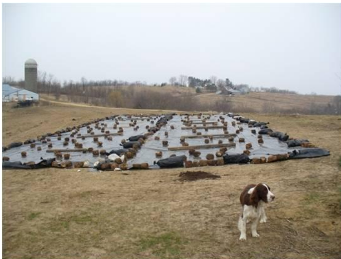
Figure 1: Site Preparation (Readstown)

The soil was amended by mixing in equal parts mushroom and dairy manure compost and applying one wheelbarrow per ten row feet. After, the compost was tilled into the soil using a hand rotor tiller. Once the canes were planted, we mulched each plant with woodchips.