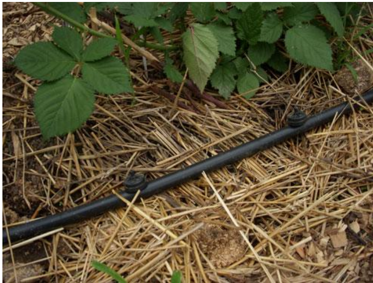
Figure 3: Drip Irrigation and Fertigation Emitters (Readstown and Rosemount)