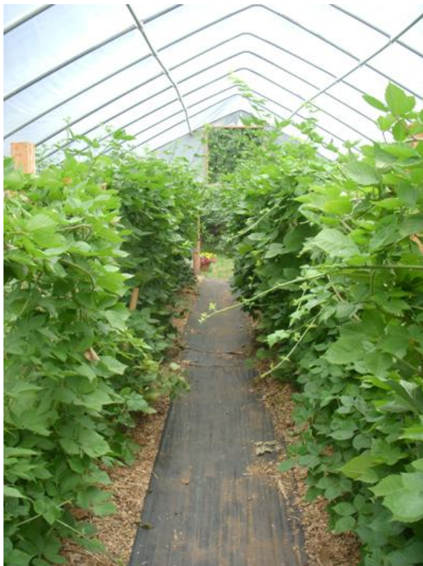
Figure 5: Floricane High Tunnel

The final harvest of the primocane berries occurred on November 18 th . After that date, the auxiliary heat was suspended and the brambles were allowed to enter the dormant phase.