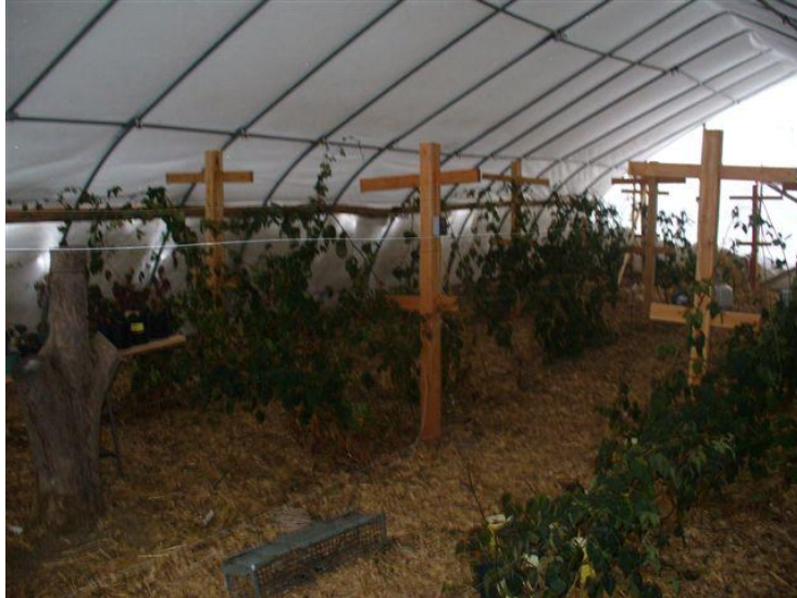
Figure 2: High Tunnel T/V Trellis System (Rosemount)

The sturdiest 3-4 canes that emerged from the crown were pruned at 4-6 feet. The trailing canes were also pruned at 4-6 feet. We allowed the leaders to grown 3-4 feet before pruning back to 12-18 inches. This was done based on the advice of Kathy Demchak who has conducted research on high tunnel grown blackberries at Penn State University. This technique promotes sturdy laterals and since only the 3-4 fruit blossoms as measured from the lateral tip actually bear fruit, it also is supposed to increase yields.