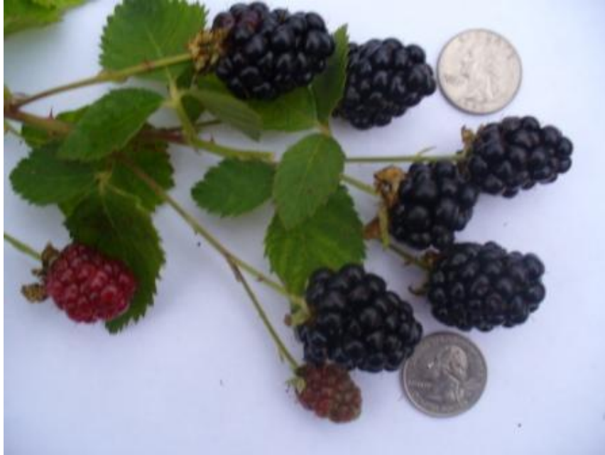
Figure 6: Primocane berry cluster on November 14th

During 2010, the floricanes displayed no visible signs of disease or pests throughout the growing season. This is typical during the first year when foliage development is relatively minimal. During 2011, we experienced a spider mite outbreak. While awaiting delivery of the biological control, we controlled the outbreak by spraying the foliage with water. Once the spider mite predators arrived ( Neoseiulus californicus ), they were released into the high tunnel, resolving the issue within a couple of weeks.