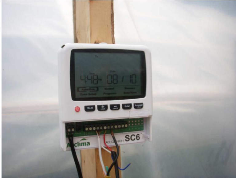
Figure 4: Acclima Moisture Sensor (Readstown and Rosemount)

The floriculture blackberry canes were planted in Rosemount on May 15th and in Readstown on June 10 th of 2010. Both tunnels contain Triple Crown, Arapaho, Chester, Apache, Ouachita, and Natchez varieties. The canes were planted in four rows with a between-row spacing of 7 feet and the outer two rows 4.5 feet from the side walls. The in-row spacing is 3 feet.