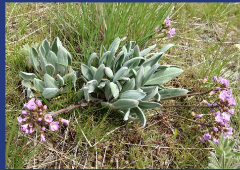
Dagger Pod ( Phoenicaulis cheiranthoides ) released by the grazing

Secondary goals for the site include establishing an area for receiving grasses, forbs, and woody plant specimens salvaged from construction sites nearby.