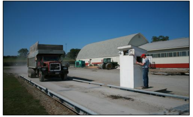
Figure 2: Using farm scales to track yield and crop inventory.

an 8 acre field. The average silage weight per truckload was 9.45 tons (based on the 20 weights from this field). The average dry mater content was 36% so yield averaged 8.5 tons DM/acre (20*9.45*(0.36)/8) or 24 tons/acre (8.5/0.35) at a standardized dry matter content of 35% DM.