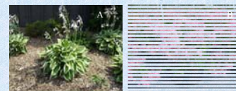
Figure 6. Hosta in full bloom (A) and Crape myrtle 'Hopi Pink' in full bloom (B).

Second generation of flea beetle larvae were first noticed between 1818 – 1860 GDD 50 and corresponding PPI included: Hosta in full bloom, Crape Myrtle 'Hopi Pink' bloom to full bloom, Crape Myrtle 'Siren Red' flower bud swell, Hibiscus in bloom and Cerastigma plumbaginoides in bloom.