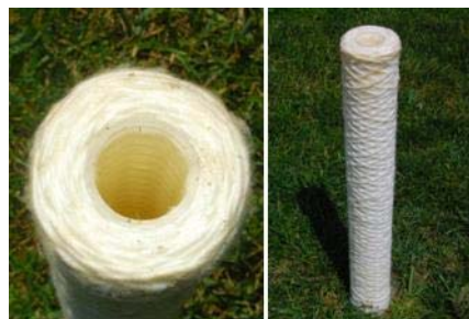
Fig. 6: End (left) and full (right) view of wound cartridge filter

People who use bag filters often install a series of filters. The first filter may take out 25 micron and larger particles, the next filter will remove 10 micron particles and the last filter removes 5 micron particles. In this way particle collection is staggered and bags do not need to be changed as often. Bag filters are