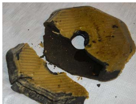
Fig. 9: Block of foots collected from between two filter press plates. The yellowish colored material is filtering media coating (diatomaceous earth) initially placed on filter plate cloth while the dark colored materials are the foots.

filtering, a mixture of clean vegetable oil and the filter media (a very fine material that acts as the filter) is pumped quickly into the stack of