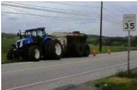
Fig. 1: Result of using SVO fuel without reliable filtering: clogged fuel filters.

As oilseeds are pressed to separate the oil and meal, particles of the crushed seed are also carried into the oil. While the pressing operation can be modified to reduce the amount of particles in the oil, some cleaning of the oil will be needed to remove these potentially unwanted particles. If used for fuel, particles are nuisances as they clog fuel filters and stop the flow of fuel to the engine (Fig. 1). As an edible oil, some operators believe that particles in the oil show that the oil is “natural”