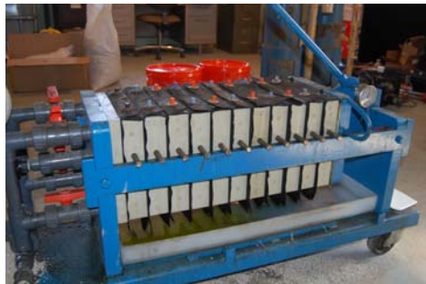
Fig. 8: Filter press; a series of filtering plates are pressed together by manual screw or hydraulic pressure.

its life the cartridge is getting is to install a pressure gauge to monitor the upstream pressure of the filter. As the filter catches more particles, the pressure will rise as it becomes more difficult to push the oil through the filter. Again, manufacturers will give guidelines of how high the pressure is allowed to get before changing out the cartridge.