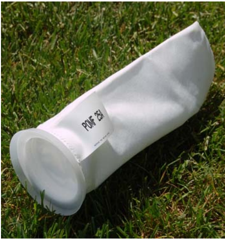
Fig. 5: Bag filter without housing

microns while up to 20% of those particles will pass through the filter. Expect to pay more for a filter rated as absolute.