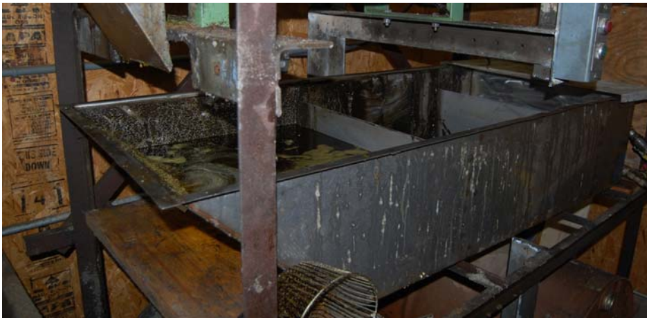
Fig. 3: In this tank pressed oil flows slowly from left to right. The oil passes across two partitions, allowing particles time to settle. Most of the settling occurs within the first partition.

expected to be removed by settling. Small particles will remain in suspension for a longer time than larger particles, so the longer the oil settles the smaller the particles are that are left in the oil.