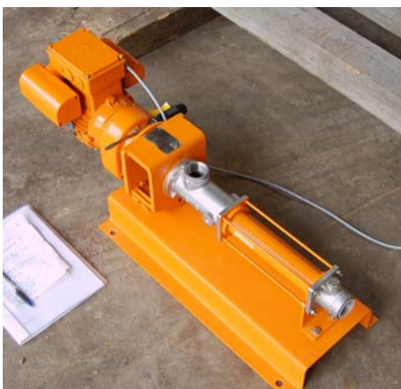
Fig. 11: Electric screw pump for filter press

A common setup includes an air-operated diaphragm pump (Fig. 10) that is able to quickly pump the initial oil and media mixture into the plate cavities, and then holds pressure as oil is pushed through the