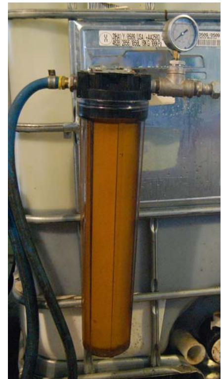
Fig. 7: Cartridge filter with clear housing used as final filter for fueling with straight vegetable oil

not inexpensive, and with the discarding of the bag each time it is used it will be an expensive option if a large amount of oil is to be cleaned.