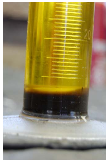
Fig. 2: 100 milliliters of canola oil collected at pressing time shows about 7 milliliters of sediment after 1 week of settling at room temperature.

siphoned, drained, or pumped from the tank leaving the residue behind on the bottom of the container (Fig. 2 & 3). Different operators settle oil from a few days to a few weeks; it all depends on what size particle is