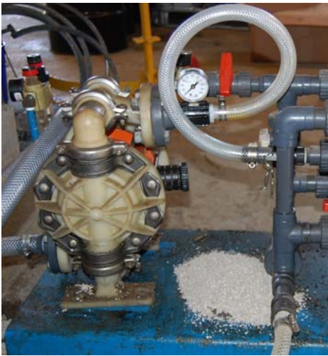
Fig. 10: Air operated diaphragm pump on filter press

maximum pressure is reached. As flow slows at a particular pressure, the pressure is stepped up and flow increases. Any method of holding pressure is acceptable.