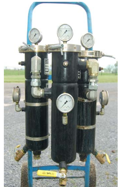
Fig. 4: Three bag filters and housings arranged in series.

People are often surprised to learn that a filter does not capture all of the particles larger than the rating of the filter as they pass through the filter. For example, many filter catalogs refer to a nominal rating or an efficiency rating for their filters. Often filter ratings are referred to as a “nominal” rating, meaning the filter will remove most, but not all, of the particles over a particular size. An “absolute” rating of a filter means