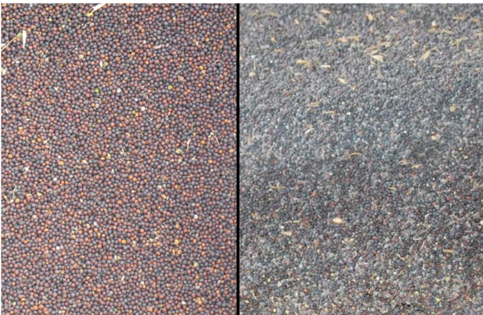
Fig. 3: Properly stored seed (left) as compared to moldy canola seed (right)