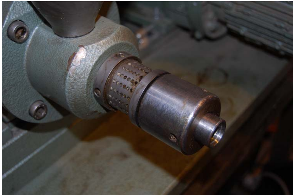
Fig. 4: Example of a press head.

The clearance between the end of the screw and the press head itself (Fig. 4) is one common adjustment, though not an adjustment available on all presses. As this clearance is made smaller, the force needed to push the seeds through the press increases, creating a greater pressure overall on the oil/meal mixture. Too much pressure, though, and the press will no longer allow the meal to pass through effectively blocking the meal flow and stopping the flow of material through the press. Too large a distance and the meal will pass through easily, leaving a large amount of oil in the meal. Finding the correct setting is a balance between the meal passing reliably through the press and extracting the maximum amount of oil while doing so.