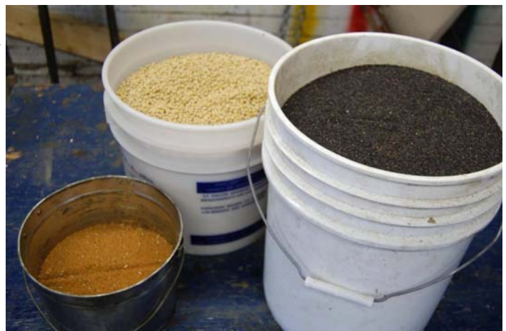
Different examples of oilseed, including (from left to right) camelina, soybeans, and canola.

Moisture content is often the culprit if pressing is difficult. On one occasion, bags of canola at 7% moisture content to be pressed were placed