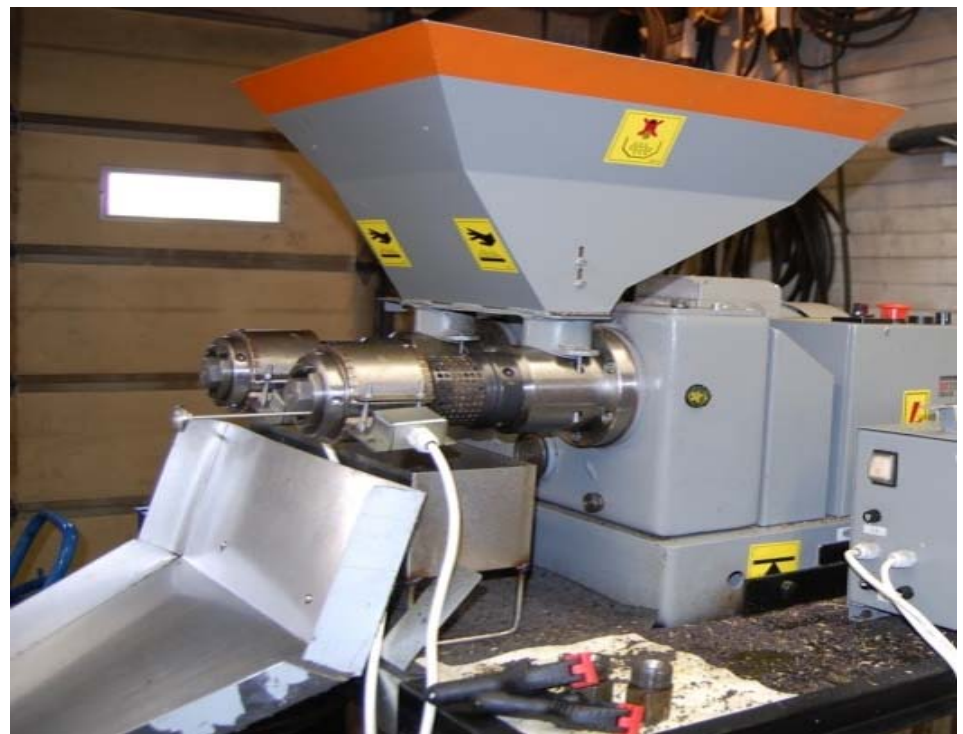
Fig. 1: Oilseed press

Oilseed presses vary in size and the amount of oil expected varies between seed types. As a result, the