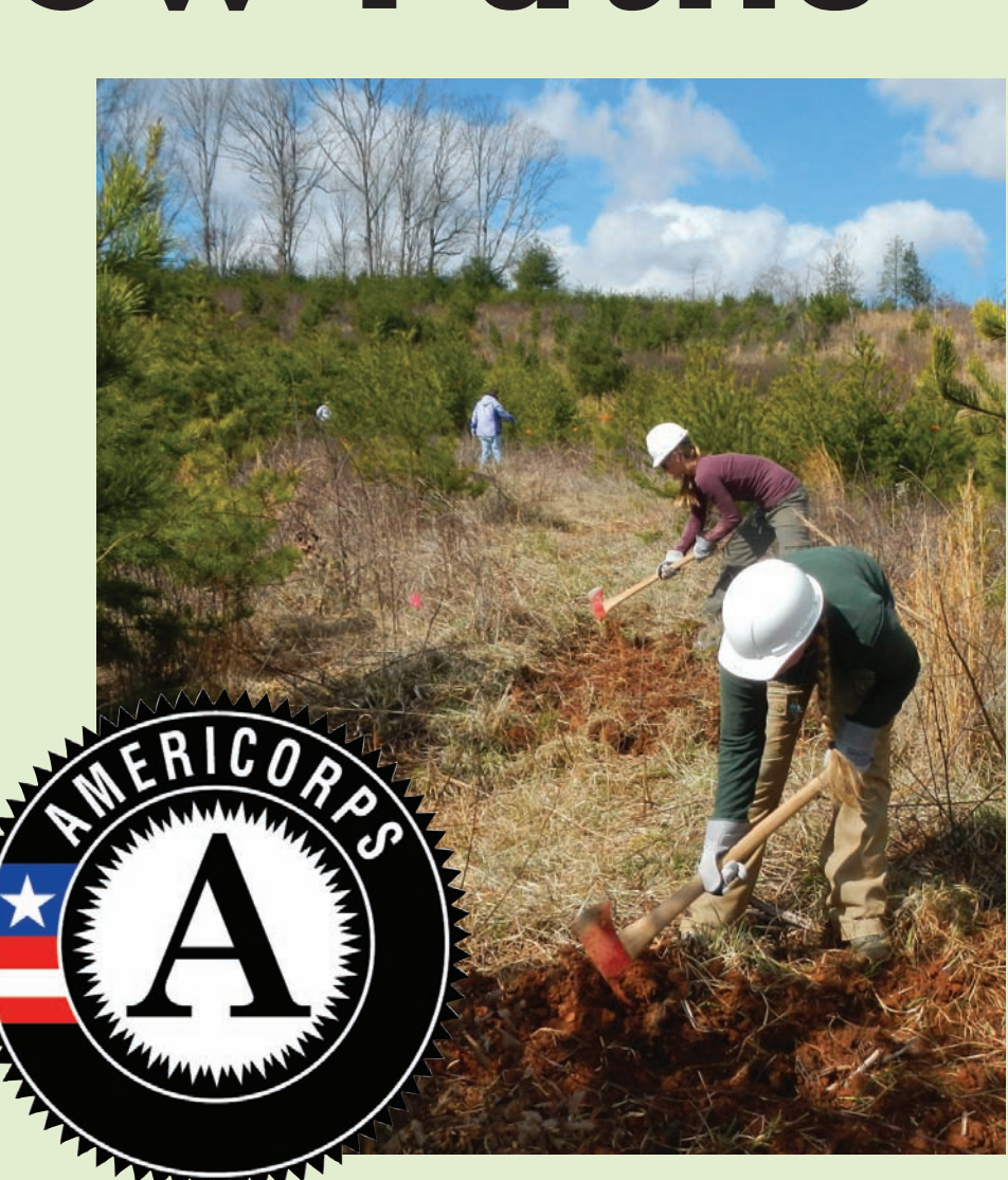
AmeriCorps Project Conserve volunteers.