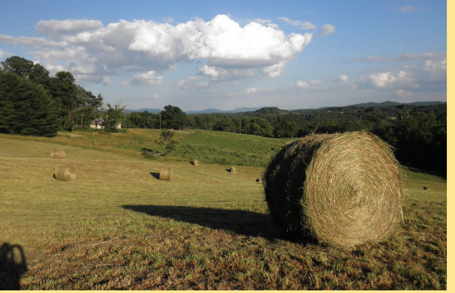
Aerial panorama of the farm

Our 1.5-mile Discovery Trail was created with community support in the form of over 1,000 volunteer and contract hours. Partners from AmeriCorps Project Conserve, French Broad River Academy, and local universities and non-profits have donated their time.