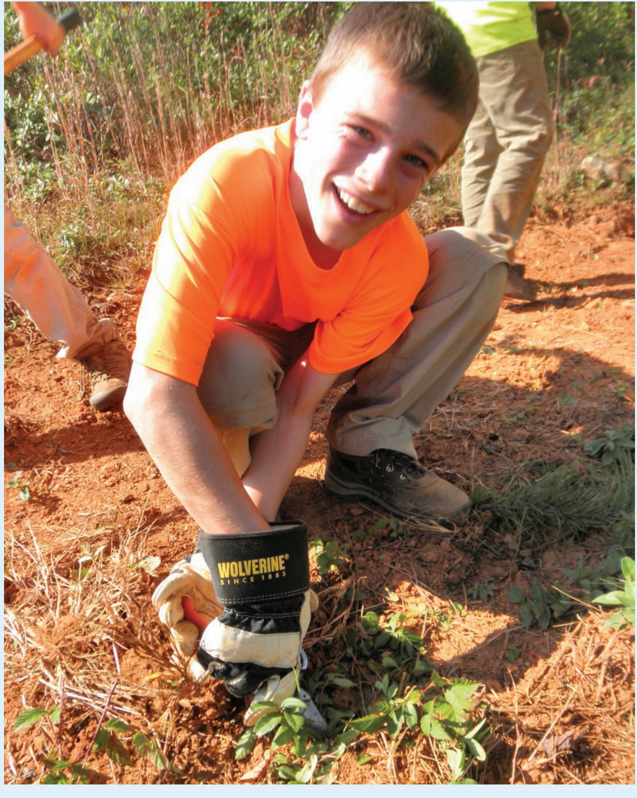
Local area students helped remove invasive plant species on the farm.

We created the Discovery Trail to help share these and other exciting projects with you, and to demonstrate how we are preserving the past while looking towards the future. Enjoy!