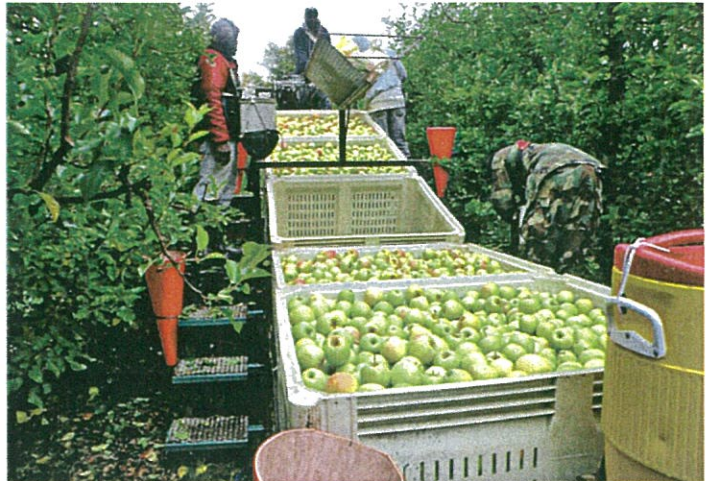
Figure 4. The Wafler harvest assist machine from New York that positions the bins close to the pickers and uses humans to fill the bins.

who has developed a harvest assist machine that uses humans to convey the fruit to the bin. With the Wafler machine, workers are positioned on a multi-level platform to eliminate the loss in efficiency from climbing up and down ladders but the bins are moved close to the workers by placing 5 bins on an innovative slanted surface positioning a bin close to each picker level (ground, mid level and top level) to eliminate the loss in efficiency due to walking to and from the bin and in climbing ladders. In this system the human picker conveys the fruit from the tree to the bin in a picking bucket. The multi level machine allows a one pass harvest of both the top and bottom of the tree.