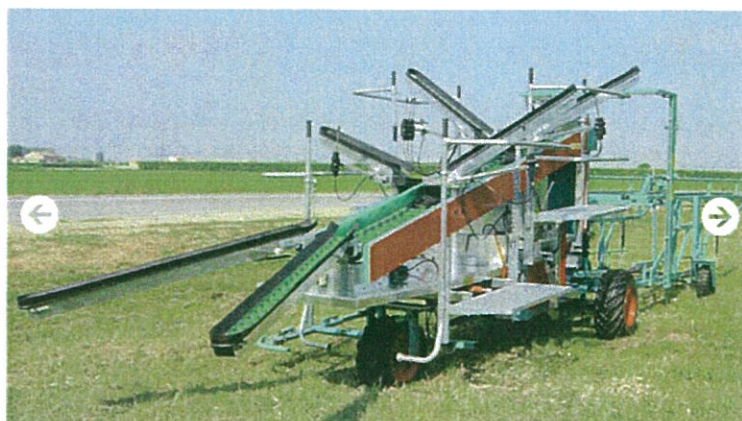
Figure 2. The Pluck-O-Trac harvest assist machine from the Netherlands which uses conveyor belts to transport fruit to the bin.

in labor efficiency was not sufficient to justify the purchase of the machines and few were sold. However, slowly over the years the machines were improved and more and more European growers have purchased these harvest assist machines but they have never been adopted in the US.