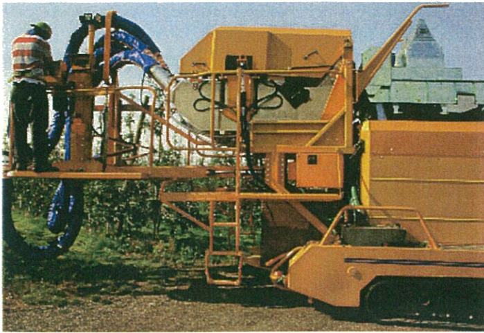
Figure 3. Picker-tech harvest assist machine from Washington that uses suction to transport fruit to the bin.