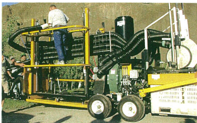
Figure 1. DBR harvest assist machine from Michigan, which uses suction tubes to transport fruit to the bin.