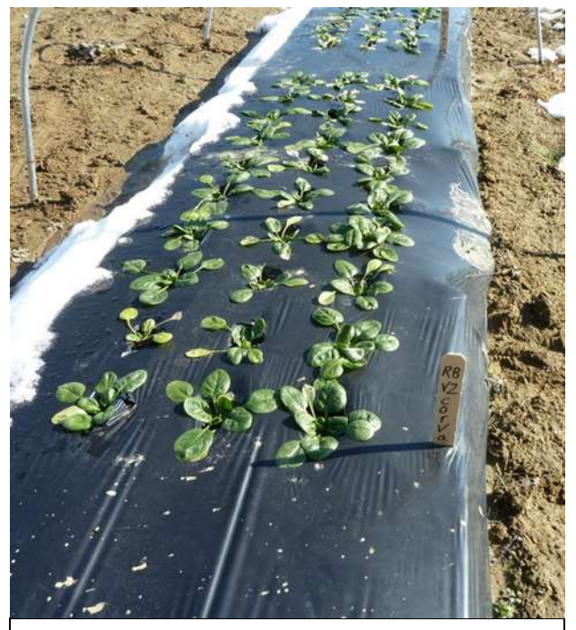
Spinach transplants three weeks after transplanting, following a late October snowstorm.

In response to increasing demand for local vegetables, growers are extending their production into the colder months. Low tunnels are one costeffective option for prolonging the fall harvest season until just prior to snow cover, as well as for growing hardy crops for early spring harvest. These temporary, unheated structures afford less winter protection than the more widely used high tunnels, and are inaccessible after the ground freezes. However, low tunnels provide sufficient winter protection for hardy fall-planted crops to survive and regrow, speeding up spring harvest by 4-5 weeks compared to spring-planted crops. Low tunnels can be erected for under $1.00 per square foot of usable bed space, estimated to be 5% of the cost of a 4-season greenhouse (Coleman 2009) or 15-30% of the cost of an unheated tunnel (Sideman). They offer the advantage of being moved annually, allowing rotation of winter production areas. Spinach is one of the hardiest, freeze-tolerant greens and is widely grown and overwintered in the Northeast, both in unheated