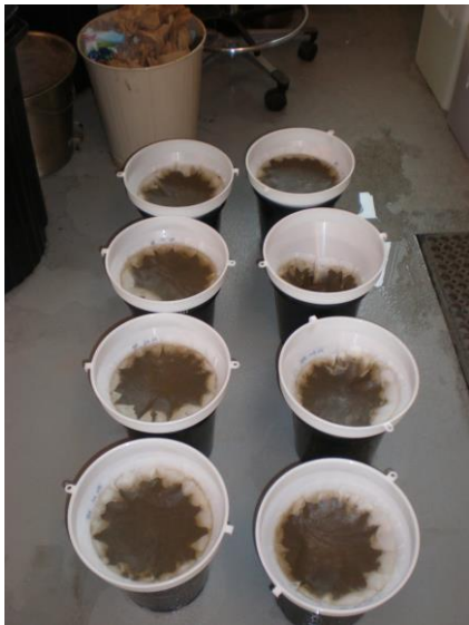
Figure 55. Wet Soil from Sieve on Filter