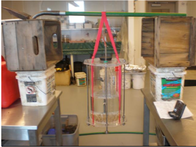
Figure 53. Cornell Sprinkle Infiltrometer