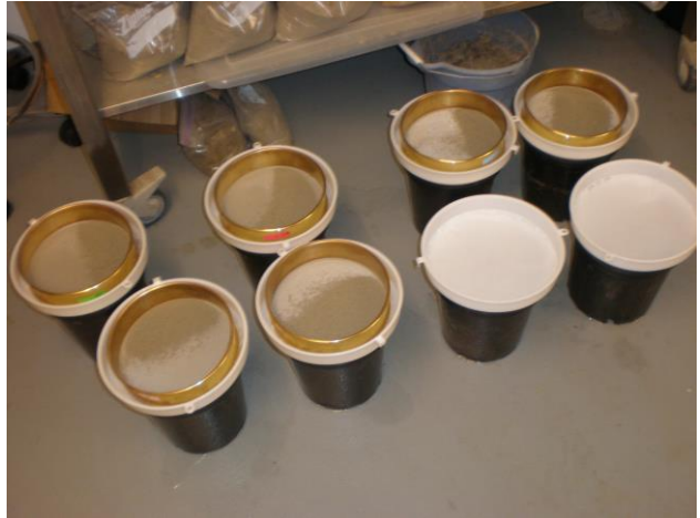
Figure 54. Dry Soil on Sieve, on Filter, in Funnel