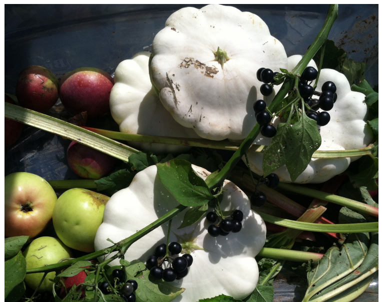
Fig 10. A hearty bounty!