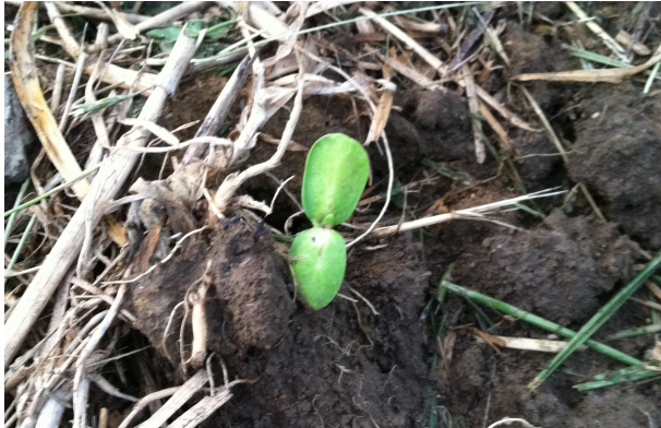
Fig 1. Sunflower seeds are sprouting! Planted 5/18