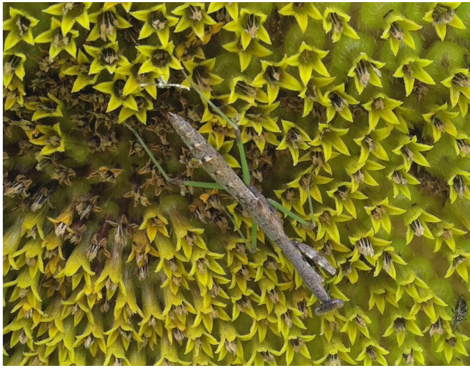
Fig 6. A symbiotic partnership: Praying Mantis & Sunflower.