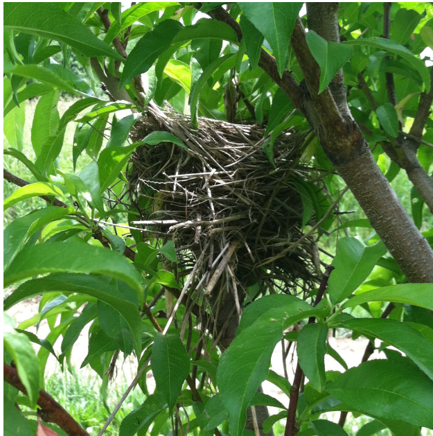
Fig 8. A safe haven for a robin's nest