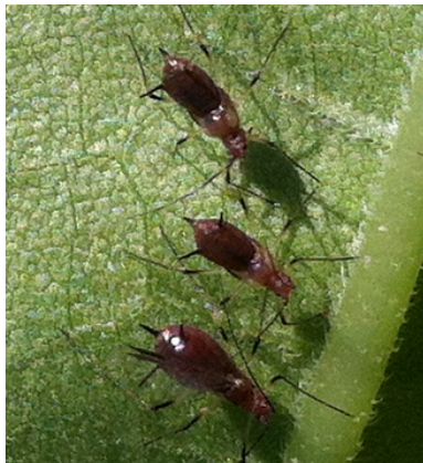
Fig 5. Aphids preferring weeds