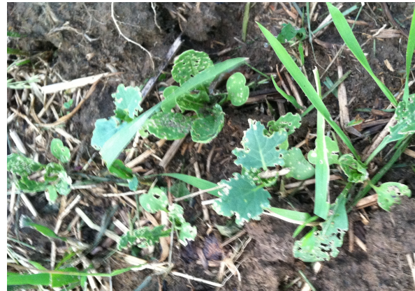
Fig 3. Leaves of leafy greens grown clover barren spaces did not successfully mature