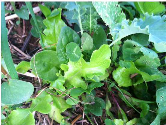
Fig 2. Leaves of leafy greens grown in clover successfully matured.