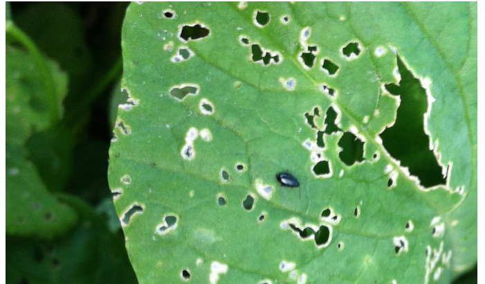
Fig 9. The wrath of flea beetles on cool season vegetables