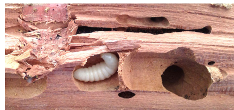
Carpenter bee larvae develop in individual cells.