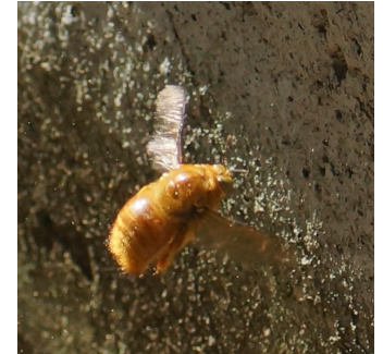
Carpenter bee male