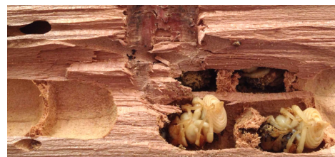
Carpenter bee pupae.