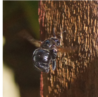
Carpenter bee female

Preventative measures that aim to discourage the bees from starting a nest are relatively simple. Bees prefer unpainted, untreated wood, roof eaves usually have unpainted areas facing the house, which are not visible from the front, and the bees tend to enter the wood on that unpainted underside. Applying sealers or paint to lanais and fences also makes them less attractive to nesting females. Existing holes from previous nests or large nails that have been removed encourage bees to drill in those areas, so sealing those areas is recommended.