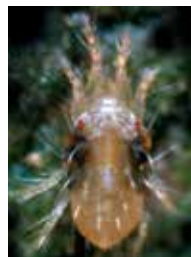
Two-spotted spider mite (above) and its damage (right).

Two-spotted spider mites can also be a serious pest of tunnel raspberries because they thrive in hot, dry tunnel conditions. Outbreaks may be severe during hot summers and absent during cooler years. The primary management approach is to adequately vent the tunnel to lower temperatures when they reach 80 F. Predatory mite species are also available for purchase and may help suppress populations if they are introduced before the spider mite populations have become a problem. Mite problems are increased by applying pesticides to control SWD since the pesticides also kill beneficial insects , including predatory mites that feed on two-spotted mites.