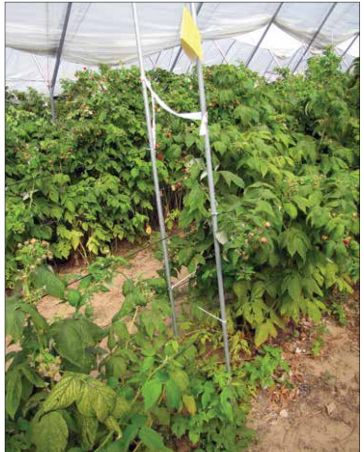
Pairs of conduit inserted into the ground 1 foot apart provide a suitable support for primocane-fruiting raspberries. Plastic wire is secured to the conduit with zip-ties.

Plants grow tall, 5-8 feet, and need a trellis for support. Sturdy end posts of wood or metal are needed. A simple system consists of pairs of metal poles, such as conduit poles, placed 18 inches apart every 20 feet down the row. Run twine or plastic wire the length of the row and secure it to the conduit at desired heights to support the