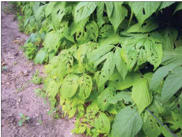
Raspberry sawfly damage.