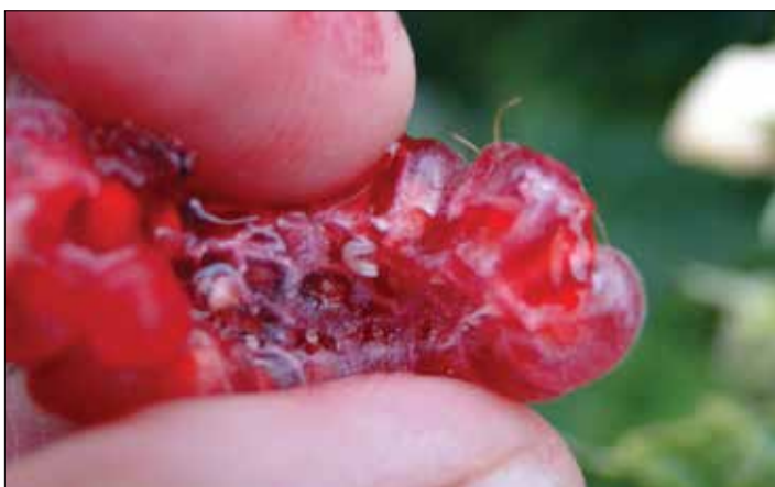
Inside of raspberry showing larvae of spotted wing Drosophila.

Spotted winged Drosophila (SWD) is the most important pest of tunnel and field raspberries. This small vinegar fly infests and contaminates berries. In mid-Michigan, populations are generally low until early August when their activity increases sharply and remains high late into the fall. This outbreak coincides with harvest of primocane-fruiting (fall-fruiting) raspberries. Organic pesticide