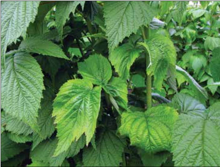
Leaves yellowing and curling from potato leafhopper damage.