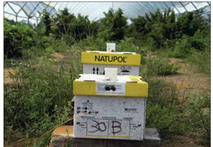
Bumble bee hives placed in tunnels for pollination.

Bees are needed to pollinate raspberries. Honey bees do an adequate job of pollinating in smaller tunnel operations. Although they do not prefer working under plastic, raspberry flowers are very attractive to them. Bumble bees are adapted to working in tunnels, but it is unclear whether the cost of hives is justified for small tunnel raspberry plantings where native bees also help. However, if tunnels are being netted for SWD exclusion, it will be essential to have bumble bee colonies for pollination. Place hives of bumble bees ( Bombus impatiens ) in tunnels before bloom begins. Bumble bees will cost approximately $0.15 per square foot ($75 per hive covering a minimum of 5,000 square feet).