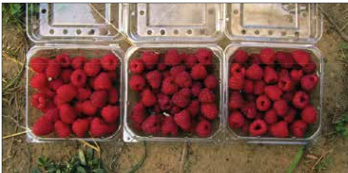
Appearance of the raspberry varieties (L to R) Himbo Top, Joan J and Polka from organic tunnels.