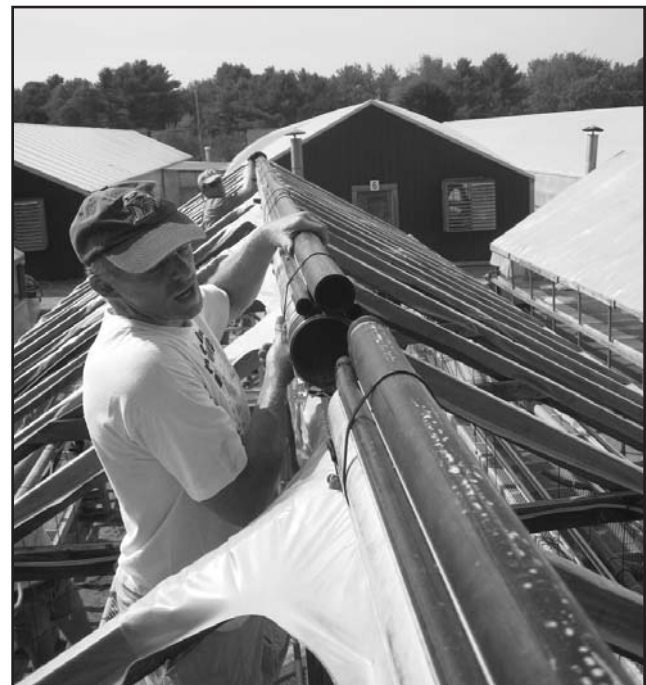
Figure 4. Installation of bubble system by consulting engineer and UVM personnel.

SunArc, a company located in Canada, expanded and improved upon the concept ( www.sunarc.ca/english/home.html ), and until recently marketed the technology in the US and Canada. Economic constraints linked with the recent financial crisis led to downsizing Sunarc, though rights to the system have been shared with a company in Israel, where it is being developed as a means of shading. While this technology is not currently available commercially, given the steadily increasing cost of fuel, we believe the work we are doing to test the system in hoop houses will revive interest and lead to its expanded commercial use by growers.