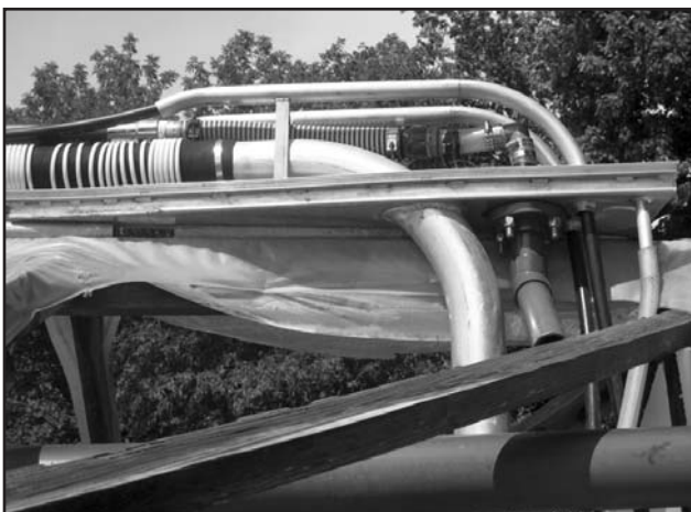
Figure 3. Piping system developed by Sunarc to inject soap bubbles between the two layers of plastic.

The bubble insulation system is not new. Over 20 years ago researchers from the Univ. of New Hampshire tested it, but ran into many problems. The foam solution leaked out or froze up slicing holes in the plastic. The freezing problem has been solved with the development of a new foam solution and leakage can be minimized by carefully making sure the plastic coverings are secure at all contact points. More recently Sunarc, a Canadian company, developed a bubble system for gutter-connected greenhouses, but it is not fully operational nor commercially available. We were fortunate to be able to obtain a prototype of their system to retrofit for smaller hoop style greenhouses that are more common in the Northeast.