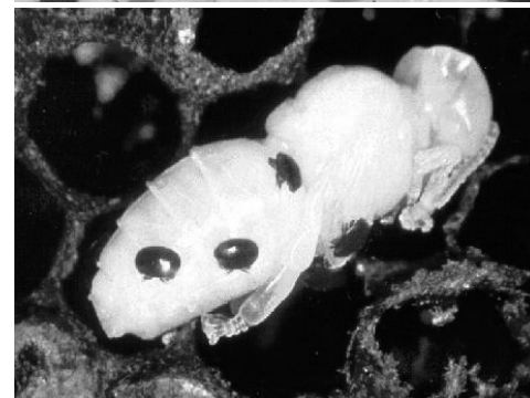
ABOVE, TOP: Dropped varroa mites on a screened bottom board insert marked with grid lines for easier counting. ABOVE, BOTTOM: Varroa clinging to a drone pupa.