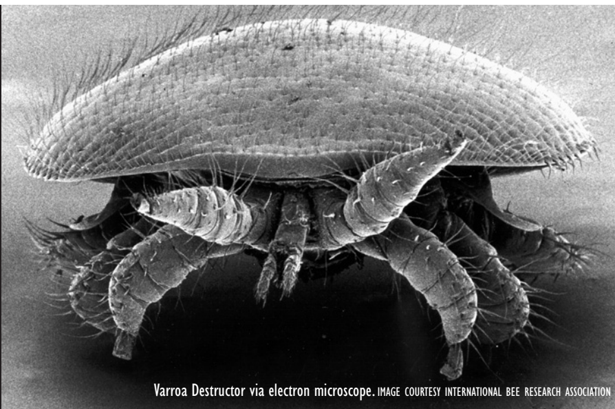
Varroa Destructor via electron microscope.