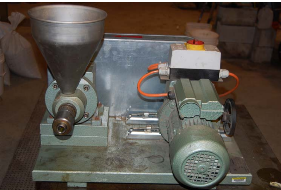
Figure 2: Small expeller press for extracting oil from seed.