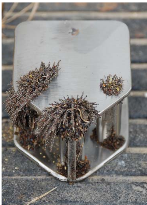
Figure 1: Ferrous metal debris collected by the magnet in the nozzle.

system from overflowing. A third “overflow” switch should be used as a safety switch in case the high level switch fails.