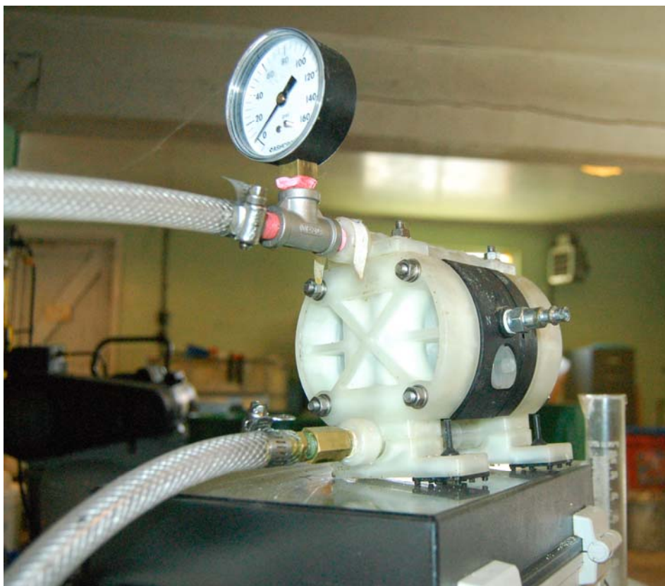
Figure 3: A small diaphragm pump.

Once filtered, the clean oil is pumped into a clean oil tank. This tank is similar to the pressed oil tank, except it is now only a storage unit. It must be sealed, like the pressed oil tank, to preserve the oil inside. Even when cleaned, the oil contains oxidants which will cause the oil to go rancid after a period of time in exposure to air. For this reason, it is best kept sealed away from oxygen.