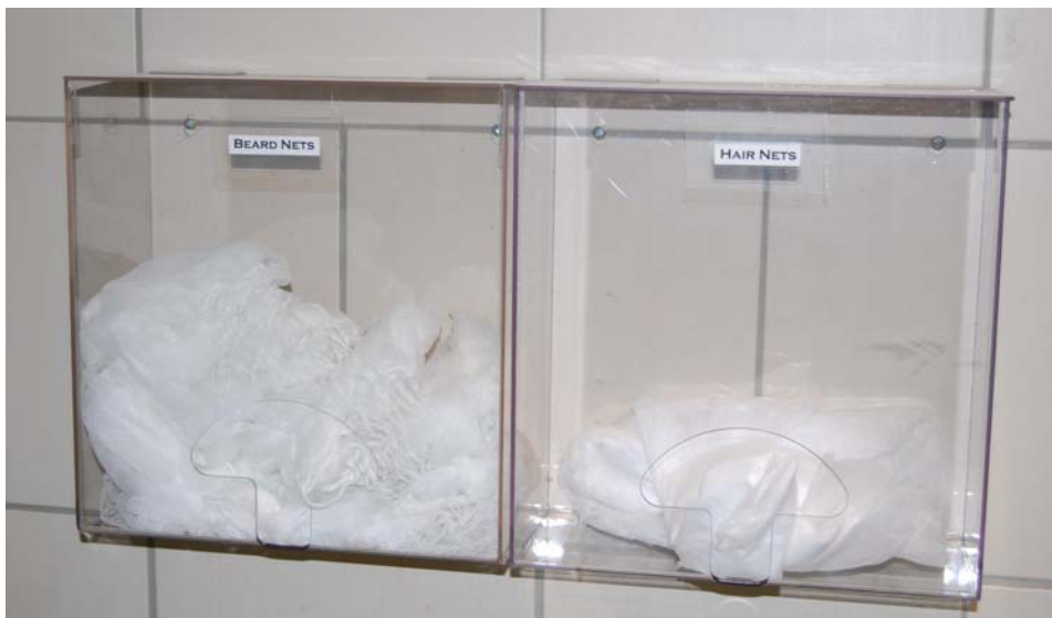
This is an example of a dispenser for hair and beard nets, which allows ease of access and promotes cleanliness in the workplace.

before coming into contact with the product, as jewelry can fall into and contaminate it