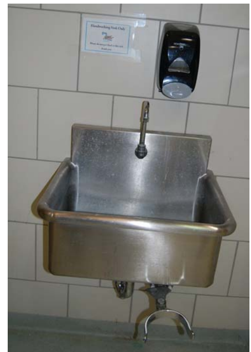
An example of a hand washing sink with proper signs reminding workers to wash hands after contact with any contaminants.