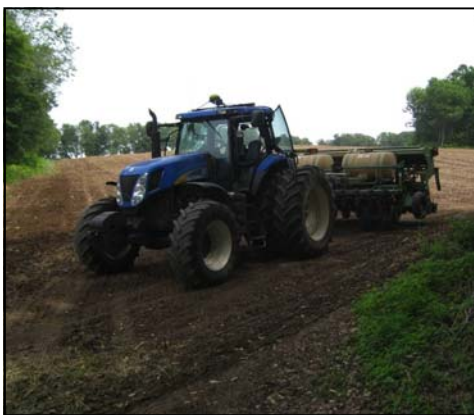
An example of a tractor run off of a combination of diesel and straight vegetable oil.

The oil which is extracted as food oil is used in the fryers in the preparation of food. The system does not stop at this point. The oil which has been used for frying and cooking is collected as waste oil. The waste oil is refined in a biodiesel reactor, which converts the oil into biodiesel, a form of bio-fuel which can be used in many diesel engines without modification.