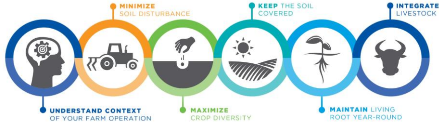
Table 1. Principles, Practices, and Restrictions of Regenerative Agriculture Versions, compared with Conservation Agriculture.