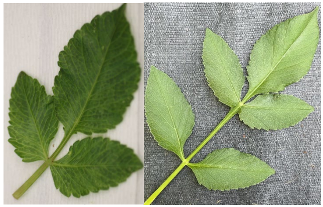
Figure 9. Left) A dahlia leaf with faint mosaic patterns from Dahlia Mosaic Virus (DMV). Right) An uninfected, healthy leaf.