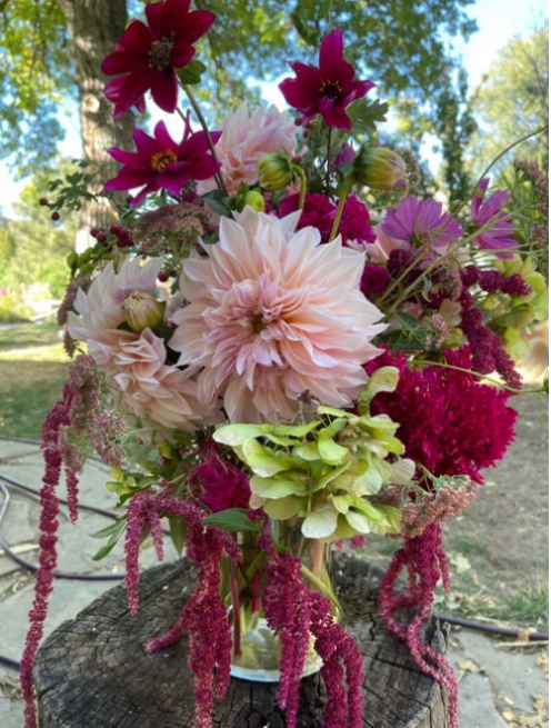
Figure 8. Dahlias as a showstopper in arrangements. 'Café au Lait' dinnerplate is featured here.

Viral diseases are very common, often introduced by infected plant stock. Finding certified virus-free stock is highly recommended, as infected plants cannot be cured and should be isolated or removed to prevent disease spread. Scout plants for virus symptoms (Table 1 and Figure 9) and pests (Table 2), and follow best management practices, such as sanitization of harvest equipment. The <u>USU Plant Pest Diagnostic Lab</u> offers comprehensive testing for in-state growers. Email Dr. Nischwitz (<u>claudia.nischwitz@usu.edu</u>) for more information. Including a picture of the suspected diseased plant, the name of the crop, and your location is recommended.