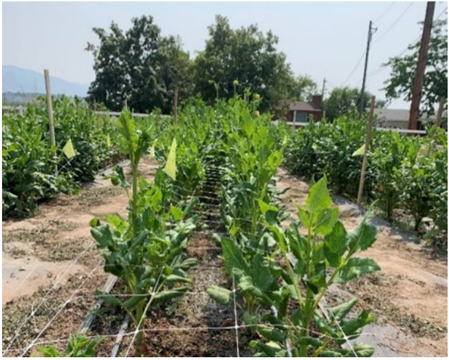
Figure 4. Dahlias with the first layer of horizontal trellis at a 12" height. As plants grow, a second layer at 24-30" will be added to prevent toppling and encourage straight stems.