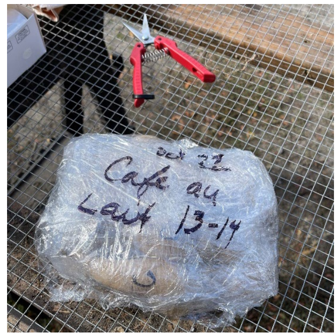
Figure 7. Tubers of two divided plants are individually wrapped with plastic, then packed together and labelled for storage in a root cellar.