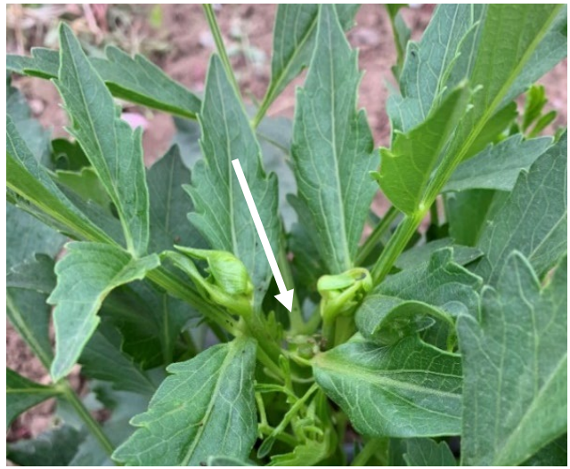
Figure 3. The terminal bud was pinched (yellow arrow) when this plant was 12-inches tall.

Pinch plants when they are 12-inches tall to promote branching. To pinch, remove the terminal bud by cutting the stem at the next node (Figure 3). Pinching can slightly delay initial bloom but increases the total yield of marketable stems and avoids unmanageable initial stems with unusably large stalks.