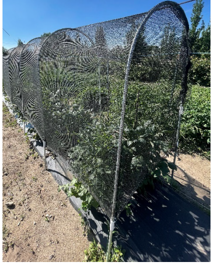
Figure 5. Dahlias oriented east-west at Wheeler Historic Farm in Murray, Utah. This allows for shade to be attached to only the south side and top of the low tunnel for more wind flow and efficient harvests.

flowering. Florist-grade stem lengths vary by market and use. Some dinnerplates were marketable with stem lengths as short as 6 to 12 inches and used in specialty arrangements, such as arches. However, minimum stem lengths of 12 to 16 inches were more common. Place the cut stems directly into water while harvesting to avoid wilting. Use of chicken wire across the openings of buckets helped place stems in water without blooms falling in and becoming wet. After harvest, strip leaves, trim the ends, and place in warm water with floral preservative. For most dahlias, a vase life of 3 to 7 days is expected if proper harvest and storage procedures are followed. Dipping stems in boiling water may help rejuvenate wilted blooms to modestly extend vase life. Larger bloom types tend to have shorter vase lives than smaller bloom types and can be more easily damaged.