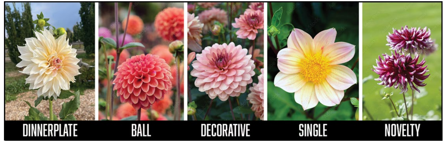
Figure 1. Example dahlia bloom types for cut flowers.