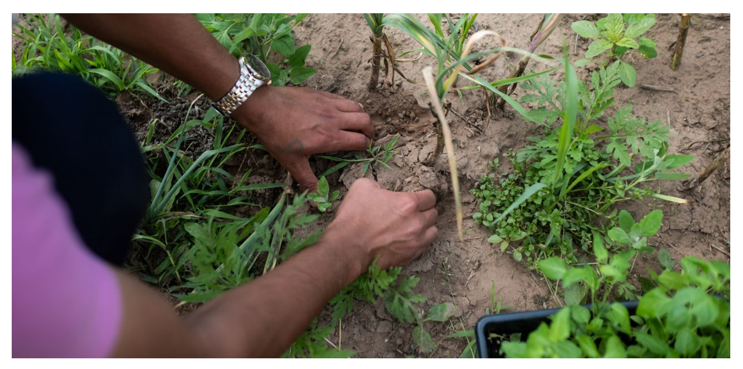
One of the farmers digs up garlic to see how much longer it needs to grow before being harvested.

Chhetri said that over the weekend, they had more than 50 refugees from across the country as well as Canada — some having just recently arrived from Ukraine — take part in workshops to show them what is possible and to encourage them find ways to do this where they are.