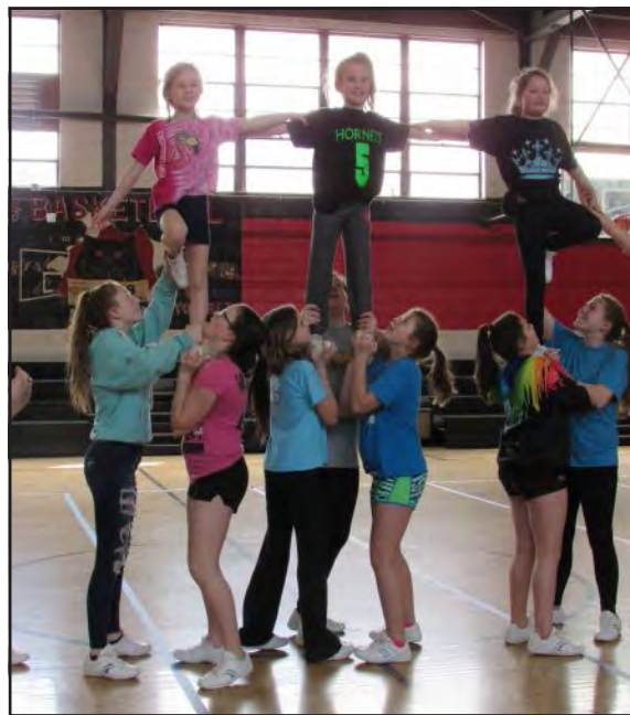
The Preston Royals practice their routine.