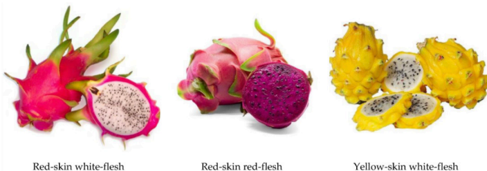
Figure 01. Fruit colors of three species of Dragon Fruit cultivated on Guam.

Dragon fruit, also known as strawberry pear, pitaya, and pitahaya, is a tropical, climbing vine-like cactus native to the Tropical Central Americas (Crane & Balerdi, 2019). There are over 15 species of dragon fruit (USDA, 2019). In Guam, at least three species can be found in cultivation: Hylocereus undatus , Hylocereus megalanthus ( Selenicereus megalanthus ), and Hylocereus spp. (unidentified species) (Bamba, personal communication, February 17, 2017). With many varieties and cultivars, in some cases it is difficult to determine species. Depending on species and varieties, dragon fruit have several combinations of colors of skin and flesh of mature fruits. Common combinations include red or pink skin with white flesh, red skin with pink or red flesh, and yellow skin with white flesh. Figure 1 depicts common colors of fruits of H.undatus , H. megalanthus , and H. polyrhizus . Table 1 lists skin/flesh colors of several species of dragon fruit. Dragon fruit has become a popular fruit in recent years to Guam markets, and has the potential to be a profitable commercial local crop.