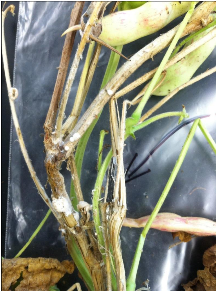
Sclerotinia (white mold)