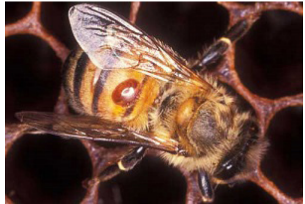
The Varroa mite ( Varroa destructor ) is an external parasitic mite of the honey bee, Apis mellifera . They are visible to the naked eye and look somewhat like a tick. Varroa mites are transported from colony to colony by drifting or robbing bees. Most infected colonies die within 1 – 2 years if not promptly treated for.

As for pesticides, the Jarretts practice caution when setting up their hives on the road, as certain pesticides can be particularly harmful to bees, especially when people are not educated on proper pesticide application practices. Backyard beekeepers can educate their neighbors about the negative impacts misusing pesticides has on bee and other pollinator species, and can promote sustainable landscape practices that help attract bees and other pollinators to their yards and gardens. Slade warned that the biggest threat to bee populations is the varroa mite, and without proper control of the parasitic mite, both backyard and commercial beekeepers will surely lose their hives.