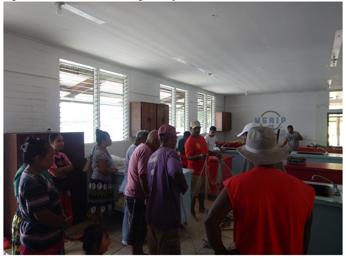
Figure 1. Demonstration of netting techniques

A structured workshop was conducted for 10 new farmer trainees on May 31, 2019 (Figures 1-5). The intention was to engage at least 50% women as farmers and there were 10 participants.