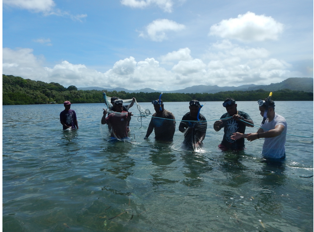
Figure 5. Fish feeding training